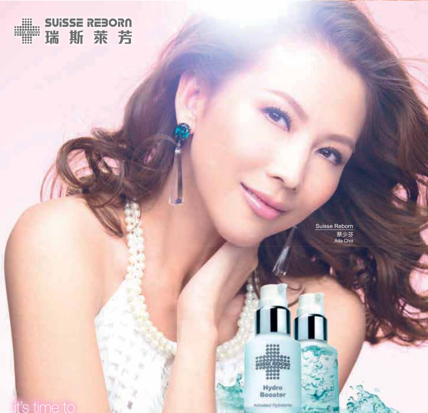
Suisse Reborn 蔡少芬 Ada Choi