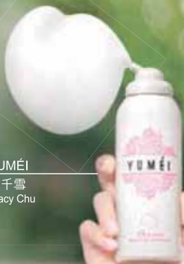
YUMÉI 朱千雲 Tracy Chu