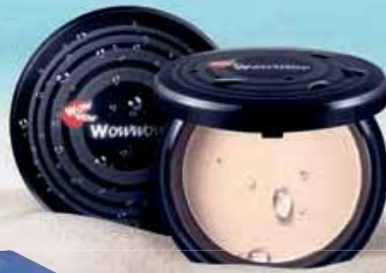
wowwow 江若琳 Elanne Kwong