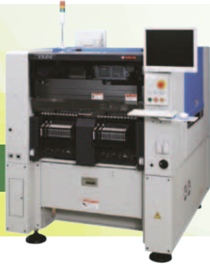
Yamaha YS 24 Yamaha YS 24 小型超高速模組貼片機

These products are distributed by WKK Distribution Limited 這些產品由王氏港建經銷有限公司經銷