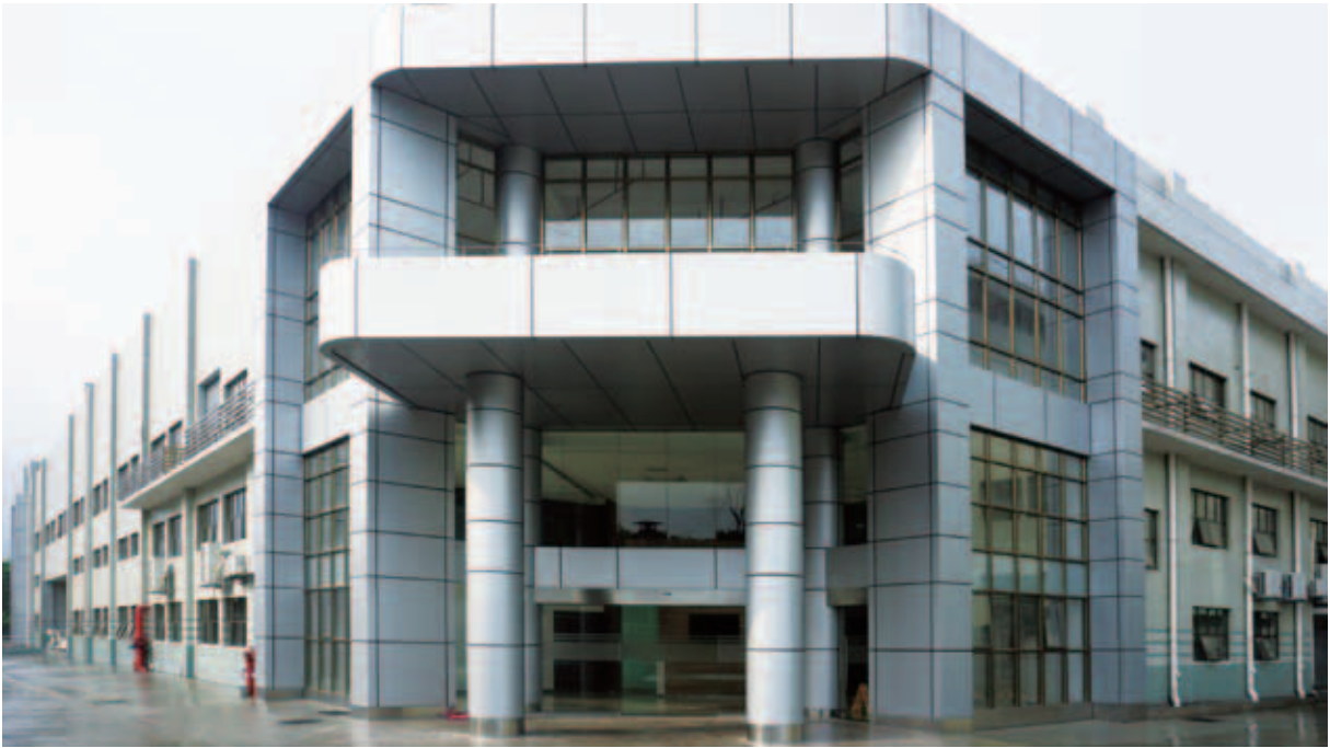
Newly completed manufacturing buildings of WKK Technology Park at Dongguan, China 新完成之中國東莞王氏港建科技城廠房