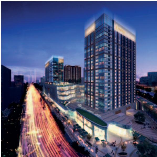
泰和龍庭 The Pinnacle