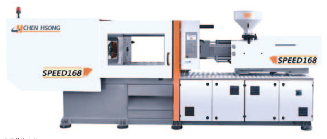
SPEED 伺服驅動注塑機 SPEED Servo Drive Injection Moulding Machine

The Group always endeavors to recover its long outstanding debts through litigation and lawful commercial means, and upon the change of market situation, has implemented appropriate and adequate measures to lower its credit risks, including: more cautious in giving credit to customers; arranging for more credit insurance coverage on credit sales; and replacement of certain credit sales by machine leasing.