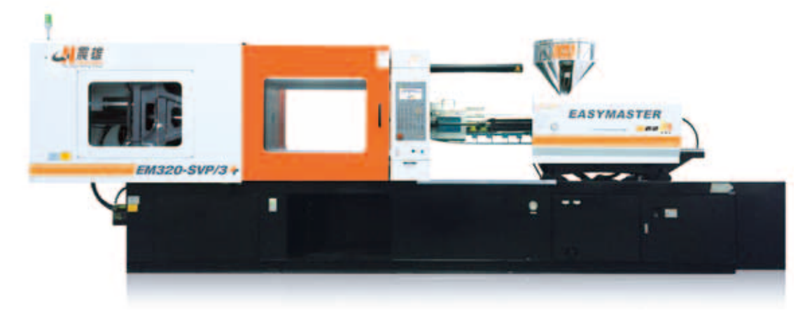
易霸第三代伺服驅動注塑機(加強版) EASYMASTER Third Generation Servo Drive Injection Moulding Machine (Plus)

The gearing ratio of the Group is measured as total borrowings net of cash and bank balances divided by total assets. The Group had a net cash position as at 31 March 2016. As a result, no gearing ratio was presented.