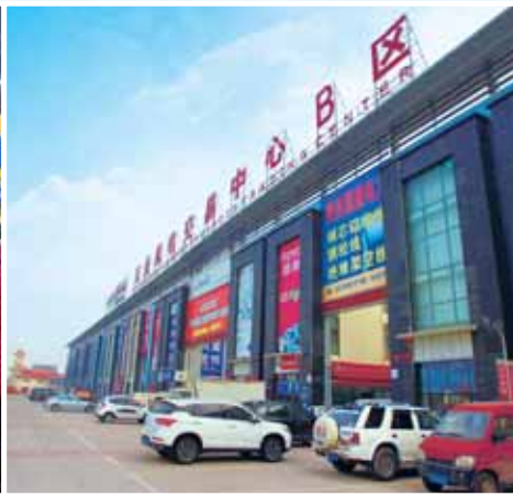
▲ Hardware & machinery trading center in CSC Xi'an 於西安華南城的五金機電交易中心