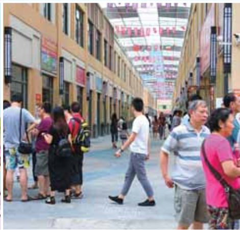
▲ CSC Chongqing in trial operation 試運營中的重慶華南城