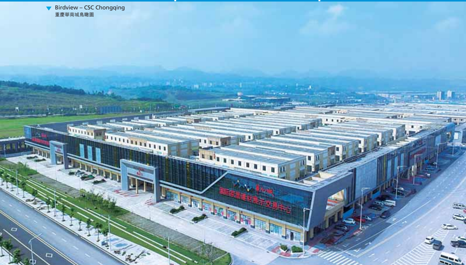
▼ Birdview – CSC Chongqing 重慶華南城鳥瞰圖