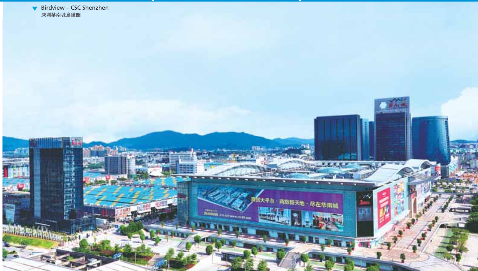
▼ Birdview – CSC Shenzhen 深圳華南城鳥瞰圖