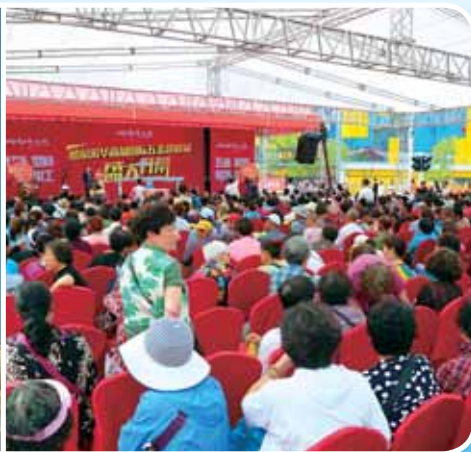
▲ Grand opening of hardware & machinery market in CSC Harbin 於哈爾濱華南城的五金機電市場盛大開幕