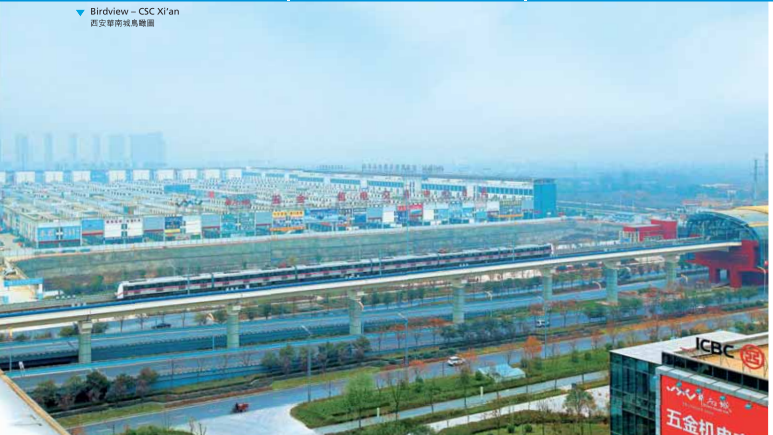
▼ Birdview – CSC Xi'an 西安華南城鳥瞰圖