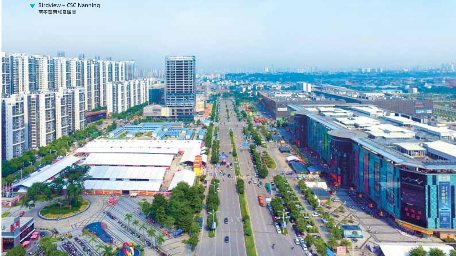
▼ Birdview – CSC Nanning 南寧華南城鳥瞰圖