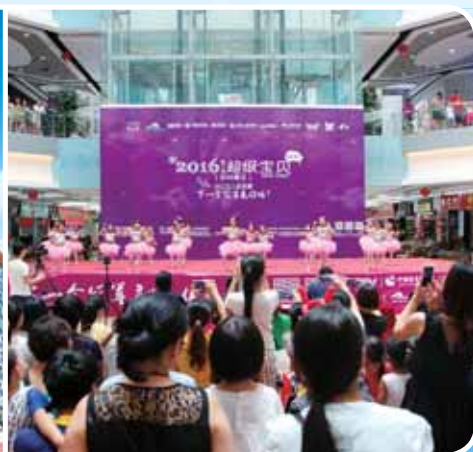
▲ Marketing campaign in CSC Shenzhen 於深圳華南城舉行的宣傳活動