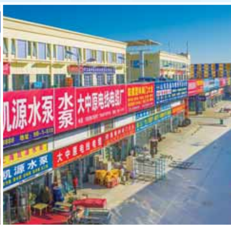
▲ Hardware & machinery market in CSC Zhengzhou 於鄭州華南城的五金機電市場