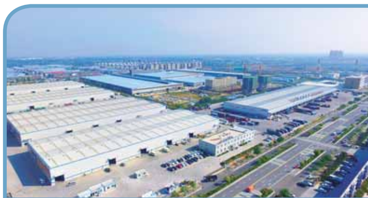
▲ QianLong Logistics and warehousing in CSC Zhengzhou 於鄭州華南城的乾龍倉儲物流

順應電子商貿的蓬勃發展，本集團計劃通過吸納領先的第三方物流公司及電子商貿企業等新客戶進一步豐富其租戶組合。本集團亦計劃提供訂制化倉庫等多種措施以滿足客戶需求從而優化其服務。通過利用華南城完善的項目網絡，中小企業及重型卡車司機對本集團物流信息交易平台的需求逐步增強，物流信息交易平台將有助於貨主更有效管理運輸成本及運用資源。