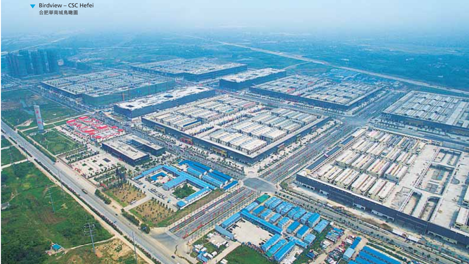
▼ Birdview – CSC Hefei 合肥華南城鳥瞰圖