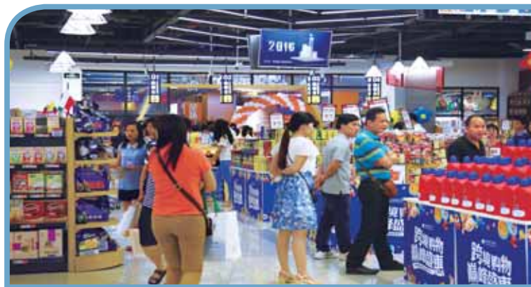
▲ Cross-border commodities outlet center in CSC Shenzhen 於深圳華南城的跨境商品直銷中心

During the Period, the outlets operations recorded a gross sales turnover of approximately RMB415 million and generated a recurring income of HK$83.2 million. Riding on its successful operations, the Group replicated the Shenzhen outlet model across other projects. Trial runs of its outlet malls in China South City Nanning (“CSC Nanning”), CSC Nanchang, CSC Xi’an and China South City Harbin (“CSC Harbin”) projects are showing positive results. The outlet mall in CSC Xi’an was the second-largest contributor among the Group’s outlet malls in terms of sales turnover and number of brands. The subway line 3 of Xi’an metro, which commenced trial operation on 8 November 2016, passes through CSC Xi’an and is expected to bring more business opportunities and visitor traffic to the region. The outlet malls in CSC Zhengzhou and CSC Hefei are slated to begin operations in the near future, which will generate more recurring income and operating cash flow for the Group.