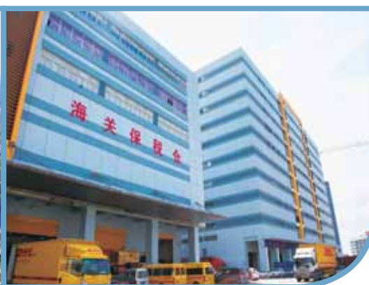
▲ QianLong Logistics and warehousing in CSC Shenzhen 於深圳華南城的乾龍倉儲物流