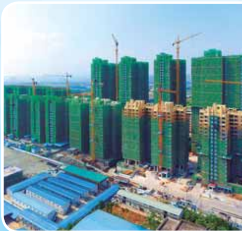
▲ Residential properties under construction in CSC Nanning 於南寧華南城的在建中住宅物業