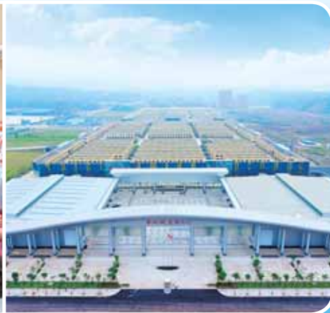
▲ The exhibition center in CSC Chongqing 於重慶華南城的展覽中心