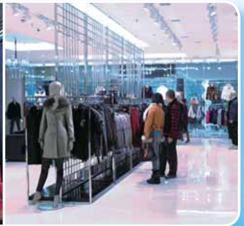
▲ Leather & fur city in CSC Xi'an 於西安華南城的皮革皮草城