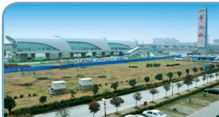
▲ The extension of Zhengzhou subway line 2 passing through CSC Zhengzhou 直達鄭州華南城的鄭州地鐵2號線延長線

位處華中地區主要物流樞紐的核心地帶，鄭州華南城在過去兩年一直是本集團在收入貢獻和發展速度方面表現最突出的項目。鑒於地方政府在搬遷和區內新基建設的建設進度，本集團認為鄭州華南城的發展潛力非常優厚，例如近期已開始試運營並即將通車，連接鄭州市中心城區及航空港經濟綜合實驗區的鄭州地鐵2號線延長線將沿鄭州華南城設三個車站。為充分發揮鄭州華南城的增長潛力，本集團將策略性地專注投放資源於該項目上。於今年7月至11月期間，本集團新購得商業、住宅及倉儲用途之土地，以支持鄭州華南城的長遠發展。