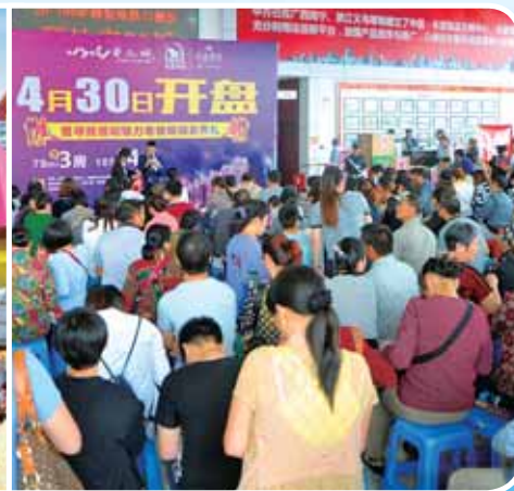
▲ Residential properties launch for sale in CSC Nanning 於南寧華南城的住宅物業開盤銷售活動