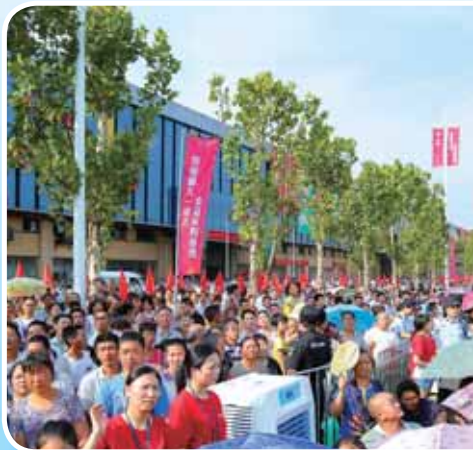
▲ The grand opening of food wholesale market in CSC Chongqing 於重慶華南城的食物批發市場盛大開幕