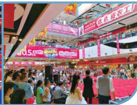
▲ Marketing campaign held in CSC Xi'an outlet mall 於西安華南城奧特萊斯商城舉行的宣傳活動

於本期間，奧特萊斯運營錄得約人民幣4.15億元的總銷售額，貢獻8,320萬港元的持續性收入。憑藉其成功的運營，本集團複製深圳奧特萊斯商城的運營模式至其他項目。南寧華南城、南昌華南城、西安華南城以及哈爾濱華南城的奧特萊斯商城試運營均獲得良好的業績表現。西安華南城的奧特萊斯商城在銷售額及品牌數量方面均已成為本集團奧特萊斯商城中第二大貢獻來源。途經西安華南城的西安地鐵3號線亦已於2016年11月8日投入試運營，將為該區域帶來更多商機及帶動更多客流。鄭州華南城及合肥華南城的奧特萊斯商城即將陸續投入運營，並為本集團帶來更多的持續性收入及經營現金流。