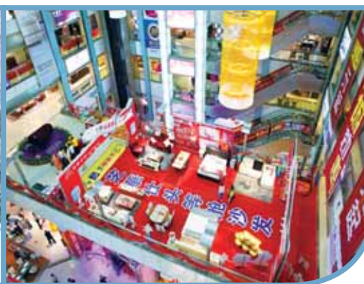
▲ HOBA Furnishing main store in Shenzhen 於深圳的好百年家居總店

為進一步加強其在批發市場物業管理方面的競爭優勢，本集團積極提升管理與服務標準。隨著新項目陸續落成，本集團憑藉其第四代綜合商貿物流及商品交易平台先進的設施，提供優質的服務以及日益增長的規模，從而鞏固其領先的市場地位。本集團通過多方面努力，成功取得了該業務板塊收入的持續快速增長。2016/17財政年度上半年，來自物業管理的持續性收入同比增長74.1%達1.532億港元。