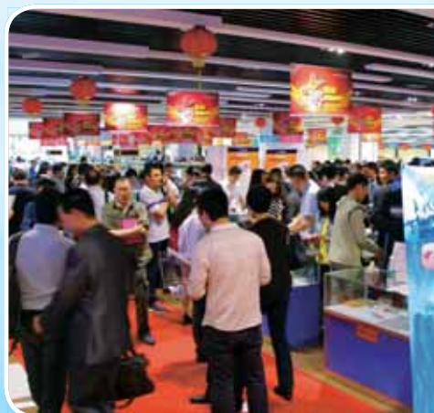
▲ Trade center plaza 5 in operation 運營中的五號交易廣場