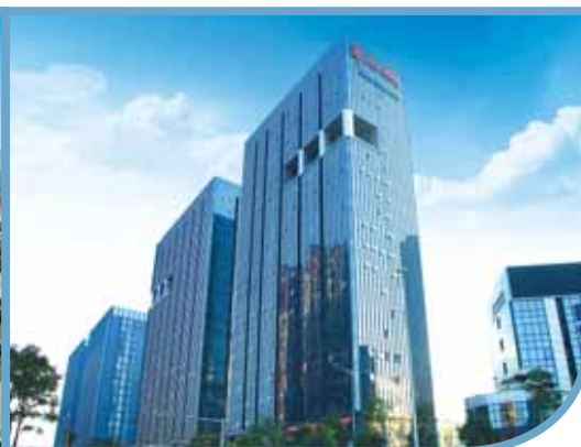
▲ International E-commerce logistics center in CSC Shenzhen 於深圳華南城的國際電商物流中心