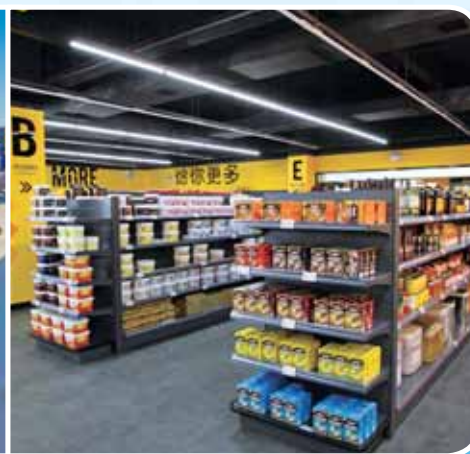
▲ Non-staple food market in CSC Zhengzhou 於鄭州華南城的副食品市場