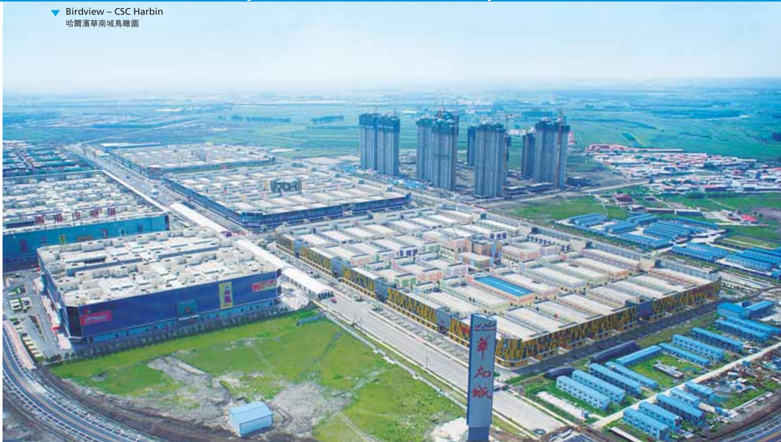
▼ Birdview – CSC Harbin 哈爾濱華南城鳥瞰圖