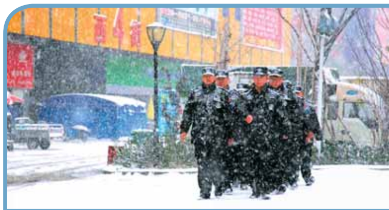
▲ Property management team in CSC Harbin 於哈爾濱華南城的物業管理團隊

In order to further increase its competitive edge in property management of wholesale market, the Group increased its efforts to raise property management and service standards. With the completion of several new projects, the Group has fortified its industry standing by utilizing its fourth-generation integrated logistics and trade centers to provide quality service and grow economies of scale. The Group's efforts paid off, as shown by the continued growth in recurring revenue and steady cash inflows provide by this segment. In 1H FY2016/17, recurring income from property management grew by 74.1% year-on-year to HK$153.2 million.