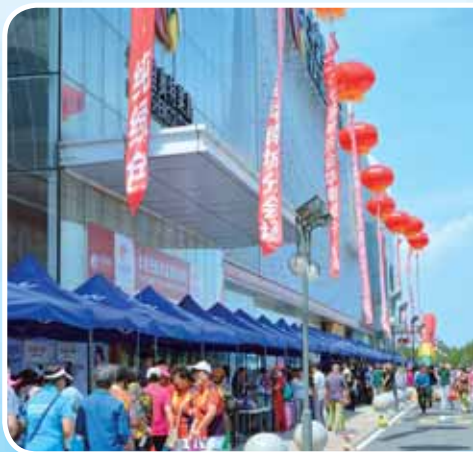
▲ The outlet mall in CSC Harbin 於哈爾濱華南城的奧特萊斯商城