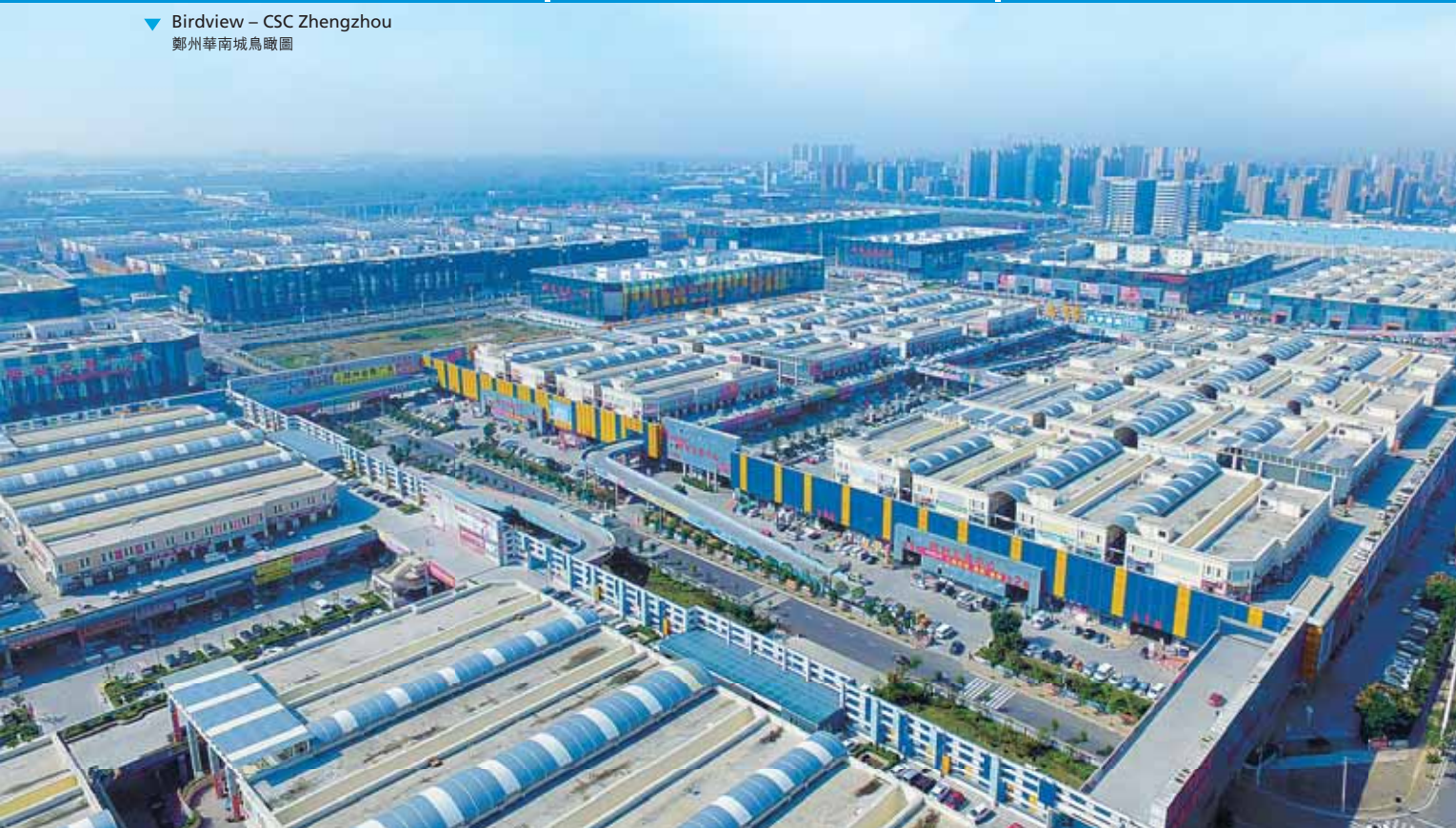
▼ Birdview – CSC Zhengzhou 鄭州華南城鳥瞰圖