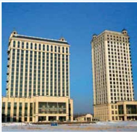
▲ Sino-Russia Trading Building & Petersburg Hotel under construction in CSC Harbin 於哈爾濱華南城在建中的中俄貿易大廈及彼得堡酒店