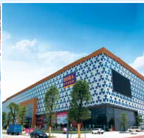
▲ HOBA Furnishing's new store in CSC Shenzhen 於深圳華南城內的好百年家居新店