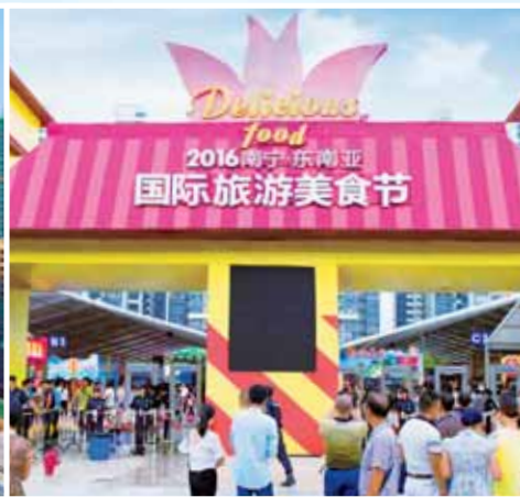
▲ International Travel and Food Festival in CSC Nanning 於南寧華南城舉行的國際旅遊美食節