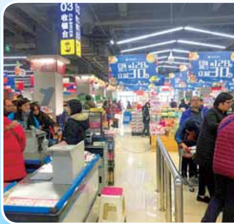
▲ Cross-border commodities outlet center in CSC Xi'an 於西安華南城的跨境商品直銷中心