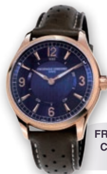
FREDERIQUE CONSTANT 康斯登