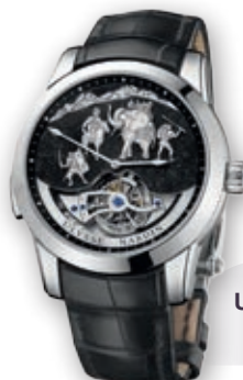
ULYSSE NARDIN 雅典