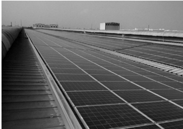
Solar plant rooftop of photovoltaic project 光伏項目太陽能廠房屋頂

Take solar photovoltaic project as an example, the Group constructed the solar photovoltaic project supported by original roofing sheets in factory, and adopted the grid model of self-generating electricity and self-use residential electricity and operated in the forms of power line communication, which can reach an annual generating power of approximately 10.27 million kilowatt, saving standard coal volume of 3,286.4 tons, reduce carbon dioxide emission of 8,544.64 tons annually, sulphur dioxide of 92.02 tons and have a remarkable social and environmental efficiency as a result. In addition, after installing the solar panels on plant roof, the temperature in workshop dropped by 4-6 degree Celsius, saving energy consumption indirectly.