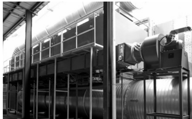
Organic air emission treatment facilities 有機廢氣處理設備