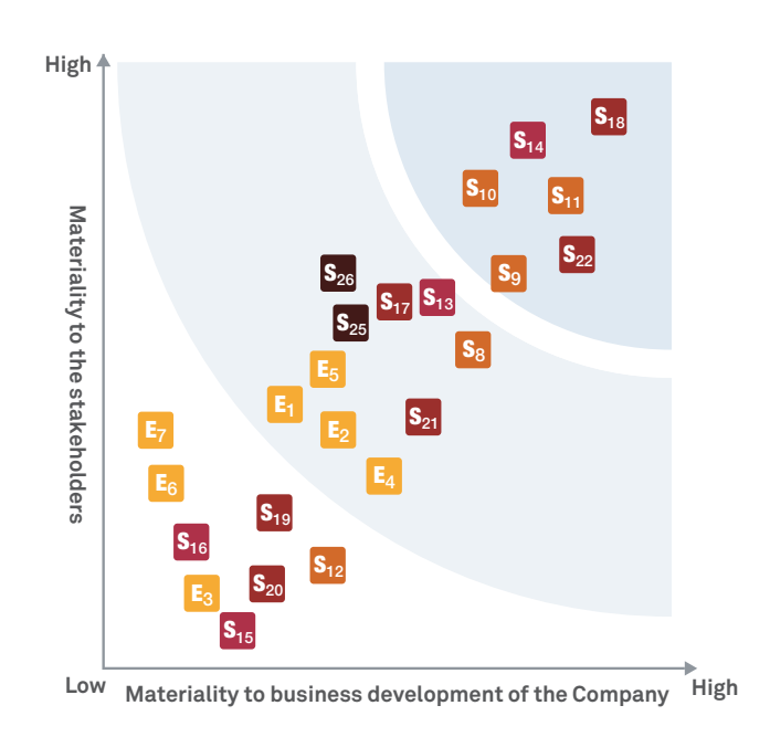
Chart 1: Materiality Matrix