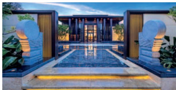
北京景粼原著 Beijing Orient Original