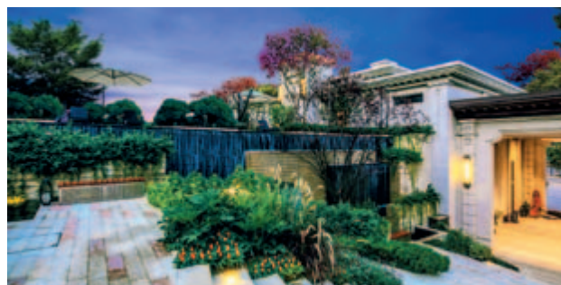
成都三千庭 Chengdu Poetic Life

In 2016, the Group achieved contracted sales of RMB88.14 billion, representing an increase of 61.6% as compared to last year. The Group sold 6,020,097 square meters in total GFA, representing an increase of 41.6% as compared to last year. Average selling price of GFA sold was RMB14,642 per square meter, representing an increase of 14.2% as compared to last year. Contracted sales from Yangtze River Delta, Pan Bohai Rim, western China, southern China and central China were RMB32.51 billion, RMB23.89 billion, RMB19.65 billion, RMB10.74 billion and RMB1.35 billion respectively, accounting for 36.9%, 27.1%, 22.3%, 12.2% and 1.5% of the contracted sales of the Group, respectively.