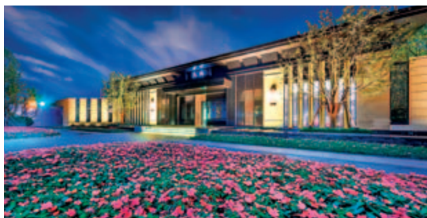
北京天琅 Beijing Glory Villa

Subsequent to the end of the reporting period, the Group successfully issued domestic green bonds denominated in Renminbi and raised a total of RMB4.04 billion in February, March 2017 with fixed rates ranged from 4.40% to 4.75% per annum and terms ranged from five to seven years.