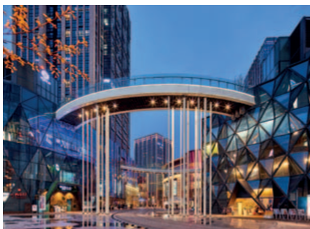
重慶時代天街 Chongqing Times Paradise Walk