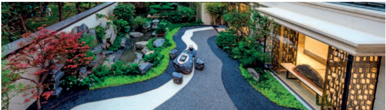
北京景粵原著 Beijing Orient Original