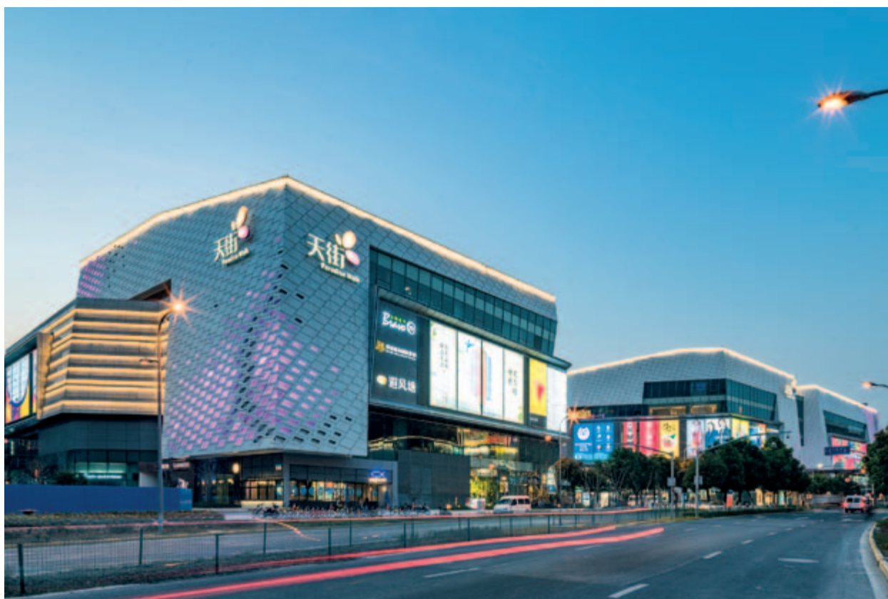
上海虹橋天街 Shanghai Hongqiao Paradise Walk