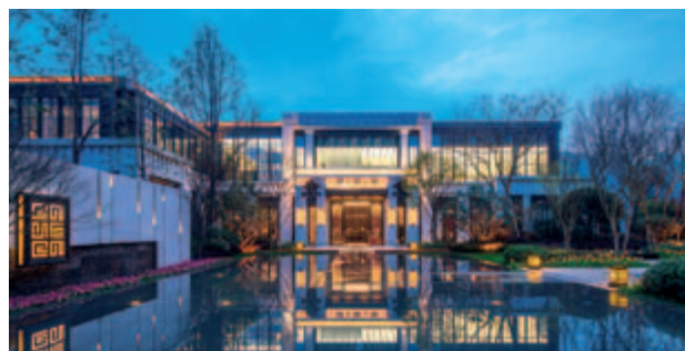
成都九里晴川 Chengdu Jasper Sky