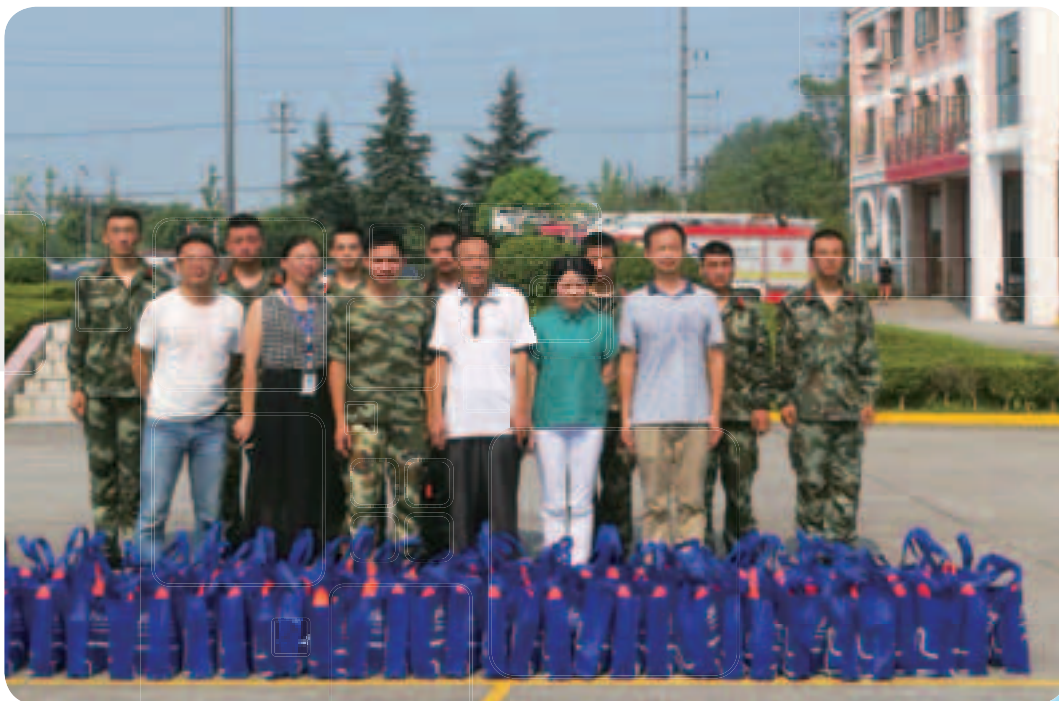
Visiting fire safety officers on the eve of "1 August Army Day" 八一前夕，慰問消防官兵