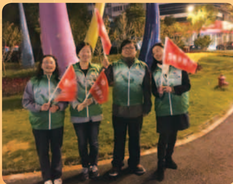
SIM community service team volunteering on the road 晨訊志願者做交通志願者