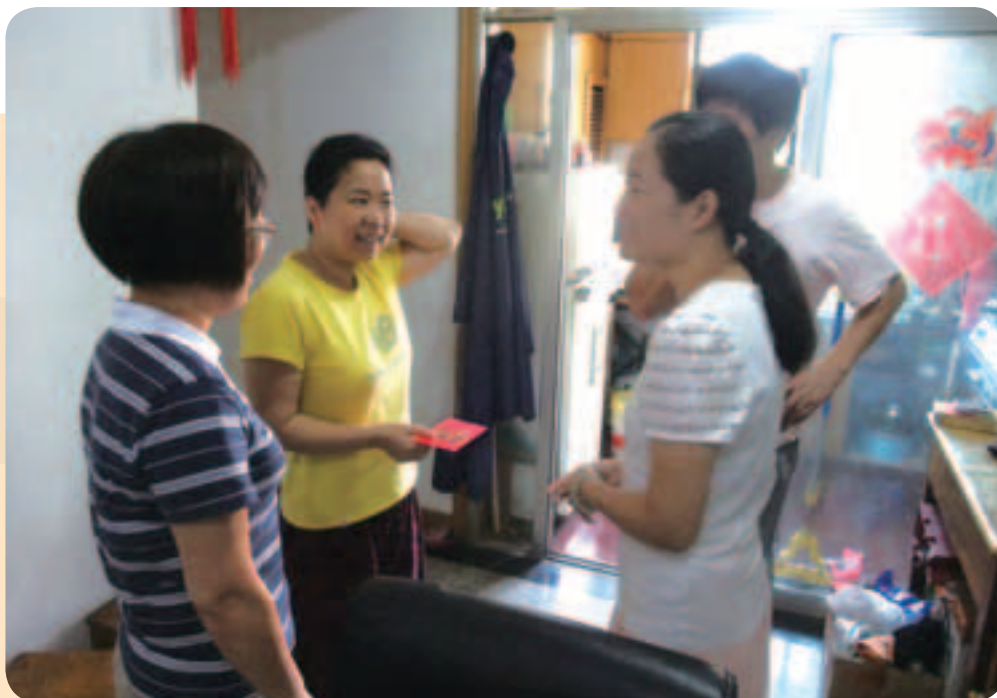
Visiting cancer patients' families to show care and concern 送溫暖－慰問社區癌症家庭