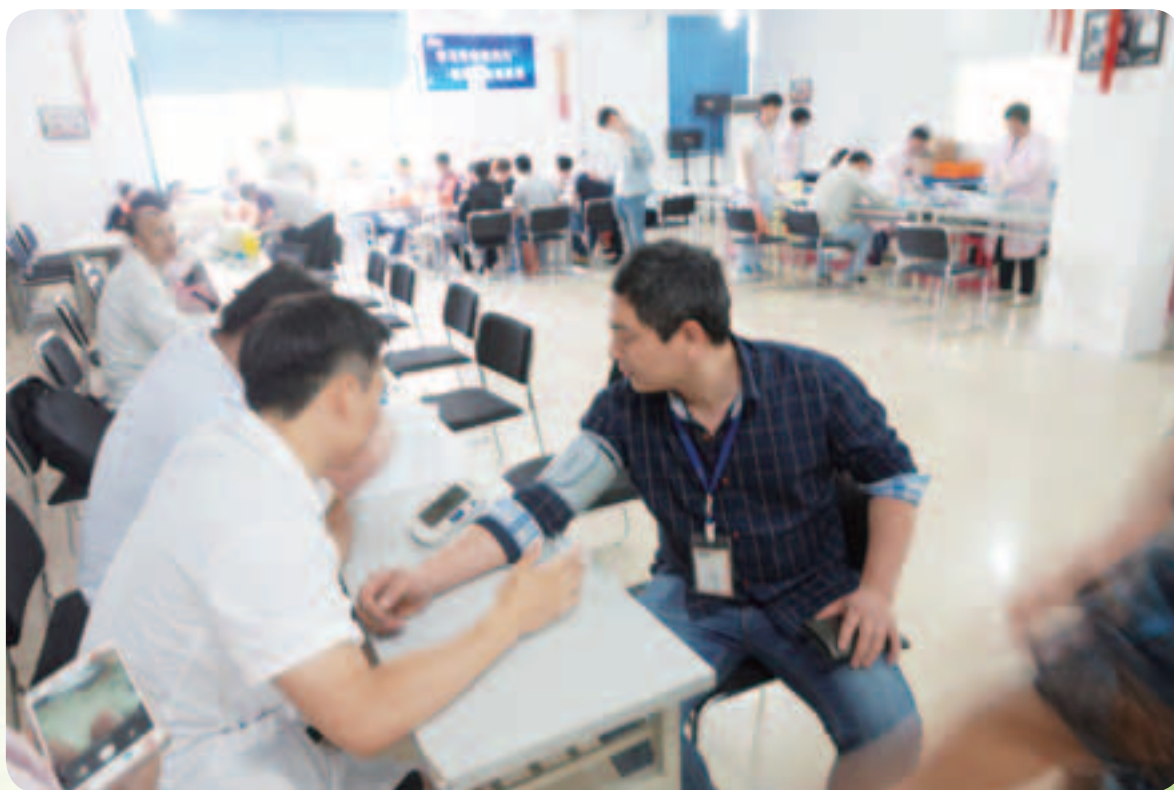
Blood donation 義務捐血活動

本集團積極主動參與社會、社區活動、成為社會大家庭積極的一分子。本集團董事會主席楊文瑛女士連年榮獲國家民政部頒發的最高慈善獎項「中華慈善獎」。本集團員工也積極參與社會公益慈善活動，自發資助江西希望小學購買文具用品等，每年參加地區義務捐血活動，慰問消防支隊官兵，關愛探望社區困難人群，以及積極參與社區組織的各項文體活動。