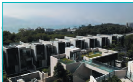
Residential project in Siu Lam 小欖之住宅項目

Another prime residential site with a sea view, at Tuen Mun Town Lot No. 490, Tai Lam , Tuen Mun, with a gross floor area of approximately 29,000 square feet, will be developed into a luxurious low-rise development, comprising detached houses and apartments. It is expected to be completed in mid-2018. This project, as well as a residential project at Siu Lam , will be well served by a superb transportation network of Hong Kong–Shenzhen Western Corridor as well as the future Tuen Mun–Chek Lap Kok Link and Hong Kong–Zhuhai–Macau Bridge. The projects are also close to Harrow International School Hong Kong, the Hong Kong branch of the prestigious, UK-based Harrow School.