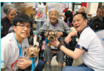
Visits to Bradbury Home 情傳白普理

本集團員工再次參加英皇慈善基金舉辦每年一度的外展義工活動，加入為期四天的探訪活動，到中國內地河北省為楊受成慈善基金(順平)老年服務中心及楊受成(中國·順平)關愛老年中心提供義工服務。