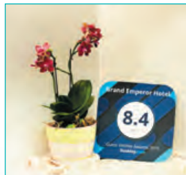
Guest Review Awards 2016 2016 年住客評分卓越獎 Booking.com

在酒店業務方面，本集團經驗豐富及訓練有素之客戶服務團隊持續提供優質的客戶服務。 英皇娛樂酒店 在提供卓越酒店服務方面獲多項美譽，近年來取得主要的酒店業獎項如下：