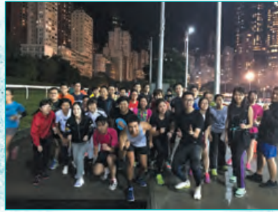
Be a Running Man