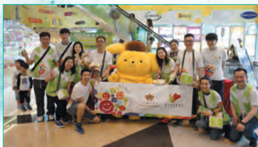
Oxfam Rice Sale Campaign 樂施米義賣

本集團動員參與慈善義賣及籌款活動，幫助社區弱勢群體。於本年度內，主要慈善贊助及捐款活動包括：