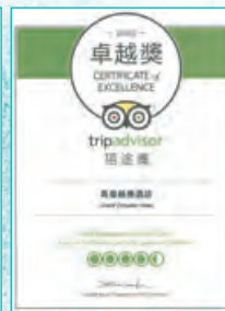
Certificate of Excellence Award 2012-2016 2012-2016年卓越獎 TripAdvisor 貓途鷹