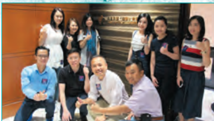
Dress Casual Day 便服日