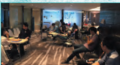
Blood Donation Day 捐血日