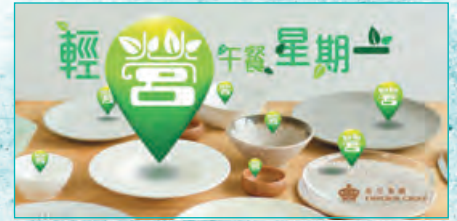
Green Monday 綠色星期一