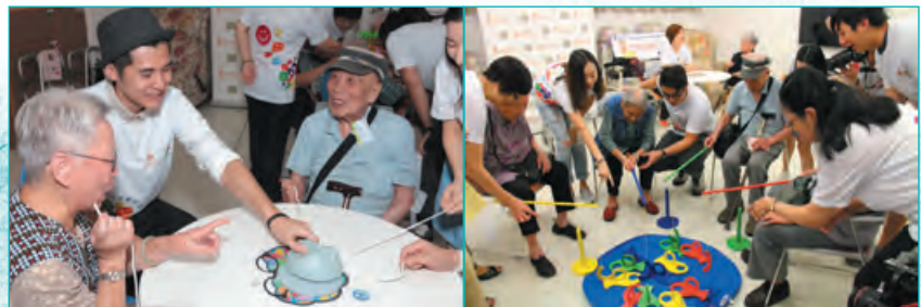
Toy Libraries for Elderly with Dementia 認知障礙症長者玩具圖書館

於2016年11月5日，本集團支持基督教靈實協會發起的「耆樂餅義賣」，為長者護理服務籌募經費。