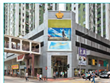
Fitfort Shopping Arcade 健威坊購物商場