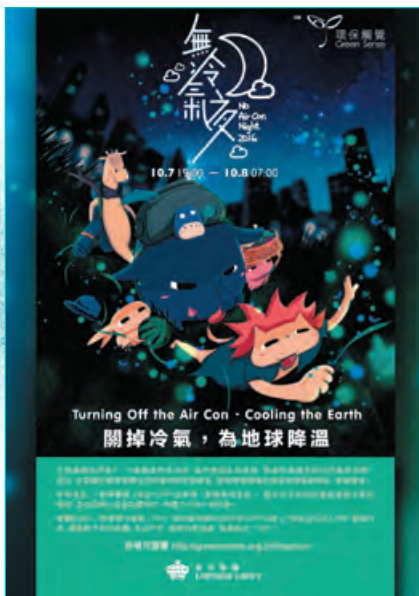
No Air Con Night 無冷氣夜

本集團連續第二年與世界自然基金會香港分會合作舉辦海下灣海岸公園潛水之旅。員工在海底探索令人讚嘆的海洋生物及天然珊瑚。這個愉快的旅程讓參與者更親近美麗的大自然，鼓勵彼等支持環境保育及可持續發展工作。