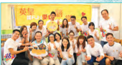
Mid-Autumn Festival Celebration at Rhythm Garden Lutheran Centre for the Elderly 路德會采頤長者中心中秋探訪