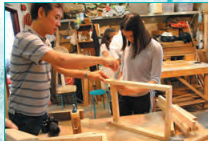
Woodworking Workshop 最愛「關」一番