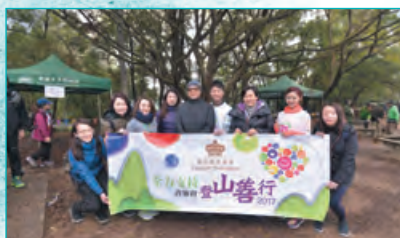
Hike for Hospice 登山善行

在基督教家庭服務中心舉辦的一項活動中，員工組成義工隊拜訪油塘獨居長者，免費為他們更換節能LED燈泡。