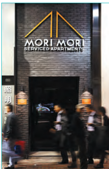
MORI MORI Serviced Apartments MORI MORI 服務式公寓

除股本及儲備外，本集團利用經營業務產生之現金流、銀行借貸、無抵押票據及向一間關連公司借取之無抵押貸款為其業務運作提供資金。於本年度，本公司發出400,000,000美元及1,100,000,000港元之無抵押票據，以為本集團提供一般營運資金。有關票據將於2021年至2022年間償還。美元票據之票息率為每年4.0%至5.0%，而港元票據之票息率則為每年4.4%至4.7%，均每半年派息一次。本集團之銀行借貸以港元及人民幣（「人民幣」）計值，並跟隨市場息率計息。本集團之銀行結餘及現金亦以港元、人民幣及澳門元（「澳門元」）計值。本集團面臨若干由人民幣匯率波動產生的外匯風險。本集團密切監察整體外匯風險及將採取合適措施以降低貨幣風險。