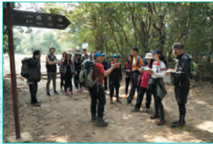
Closer to Nature Hiking Course 踏青樂悠遊 - 生態遠足導賞班