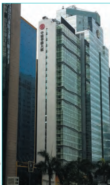
China Huarong Tower 中國華融大廈

本集團採取積極措施優化零售與非零售物業之比例，以建立對突發危機呈抗跌力之投資物業組合。本集團將繼續於大中華地區以及全球主要城市搜尋具有良好潛力的優質及高檔投資物業，增強其投資物業組合，並繼續提供長遠經常性租金收入之主要來源。本集團預期，位於北京的 英皇集團中心 及澳門半島的 英皇南灣中心 將於2017/2018年財政年度開始產生重大的額外租金收入。加上新收購的優質物業倫敦 Ampersand大廈 及半山 輝煌臺 的零售商舖，本集團可透過長期穩定的租金收入增長確保穩定的經常性現金流。