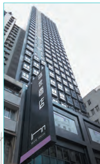
Inn Hotel Hong Kong 香港盛世酒店