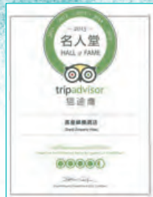
Hall of Fame 2015 2015年名人堂 TripAdvisor 貓途鷹