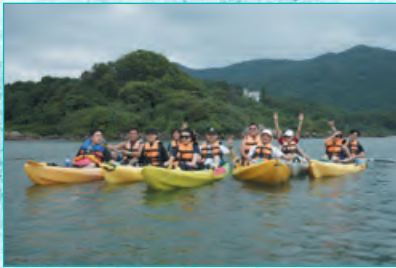
Fun Rafting 水上樂逍遙 划艇初體驗