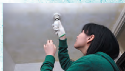
Lights Up Homes of Elderly 燈泡傳愛暖萬心