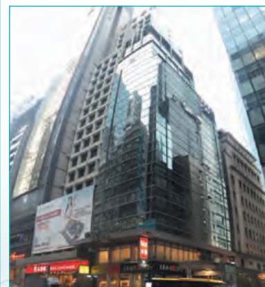
Wincome Centre 永傑中心