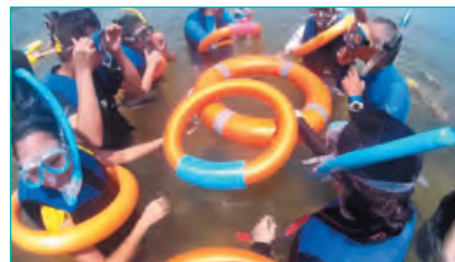
Hoi Ha Wan Marine Reserve Snorkelling Tour 浮潛樂於海下灣