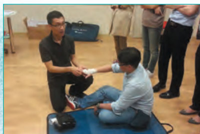
First Aid Class 急救班

於本年度，本集團為員工安排了急救課程，令其能夠在工作場所及其他場合向受傷僱員提供及時合適的急救處理。