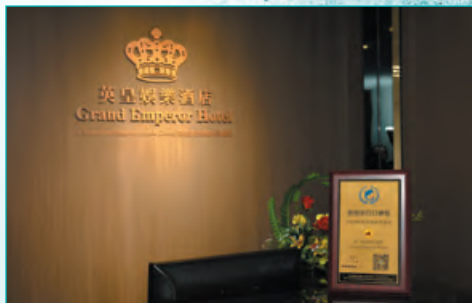
Best Service Award 2016 2016年度最佳服務酒店獎 Ctrip 攜程