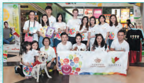
Charity Sale for Hong Kong Seeing Eye Dogs Services 香港導盲犬服務中心慈善義賣活動