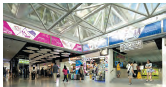
New Town Mansion Shopping Arcade 新都商場

本集團持有大量優質投資物業，主要為位於香港主要購物地區之零售地舖。主要投資物業包括位於銅鑼灣 羅素街8、20、22-24及50-56號、波斯富街76號及駱克道474-476、478-484、507、523號 、尖沙咀 廣東道4-8號、彌敦道81、83號、海防道35-37號及漢口道25-29號 之零售商舖、淺水灣 The Pulse 、北角 健威坊購物商場 及屯門 新都商場 三樓。