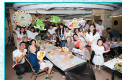
“Let’s Dance” Dragon Boat Festival Celebration at Longevity Palace 「舞動端午」松山府邸探訪