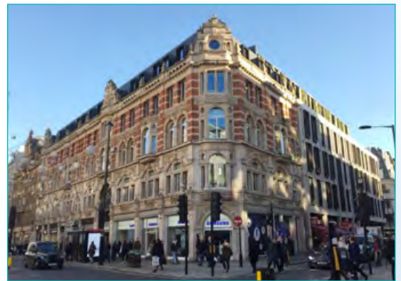
Ampersand Building, London 倫敦 Ampersand 大廈

本集團最近於2017年6月完成收購 Ampersand大廈 ——一幢集合零售商舖、辦公物業及租賃式公寓的綜合大樓，位於倫敦牛津街111-125號。該物業為一幢八層（連地庫）永久業權的綜合大樓，總樓面面積約90,999平方呎。位於倫敦西區黃金零售及熱門蘇豪式寫字樓地段，該物業亦鄰近托特納姆法院路橫貫鐵路發展項目，人流如鯽。該收購符合本集團的策略重心，以整幢形式在世界著名大都市的主要街道購入長期受零售及辦公室租戶垂青的優質資產，實屬罕有機會。