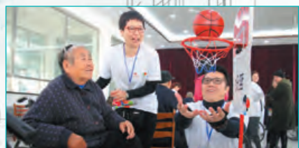
Outbound Volunteering Trip 外展義工活動