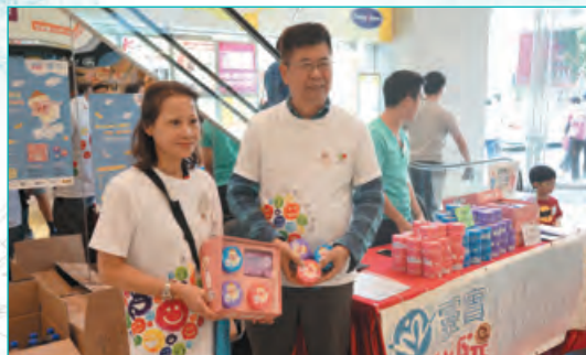
Qile Cake Charity Sale 耆樂餅義賣大行動