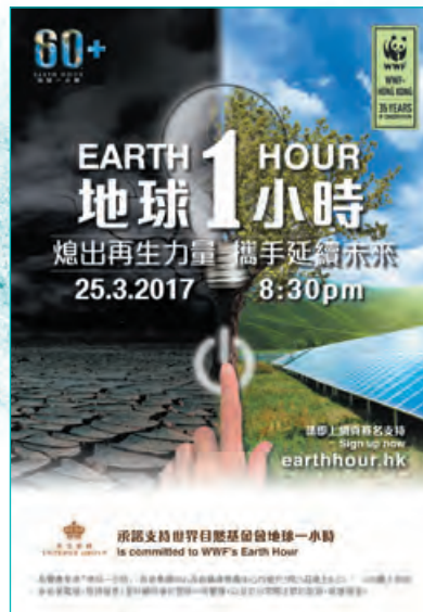
Earth Hour 地球一小時