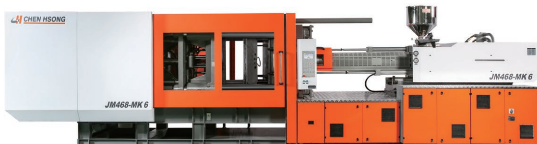
捷霸MK6伺服驅動注塑機 JETMASTER MK6 Servo Drive Injection Moulding Machine

Due to an unexpectedly robust market during the second half, with demands concentrated on the MK6 and two-platen product lines, the Group experienced certain supply chain difficulties due to the unavailability of spare parts and other bottlenecks at vendors. As a result, there were demands that the Group had not been able to fulfill due to lack of products – a situation that the Group is actively resolving through working closely with suppliers to increase their capacities and developing new supply sources.