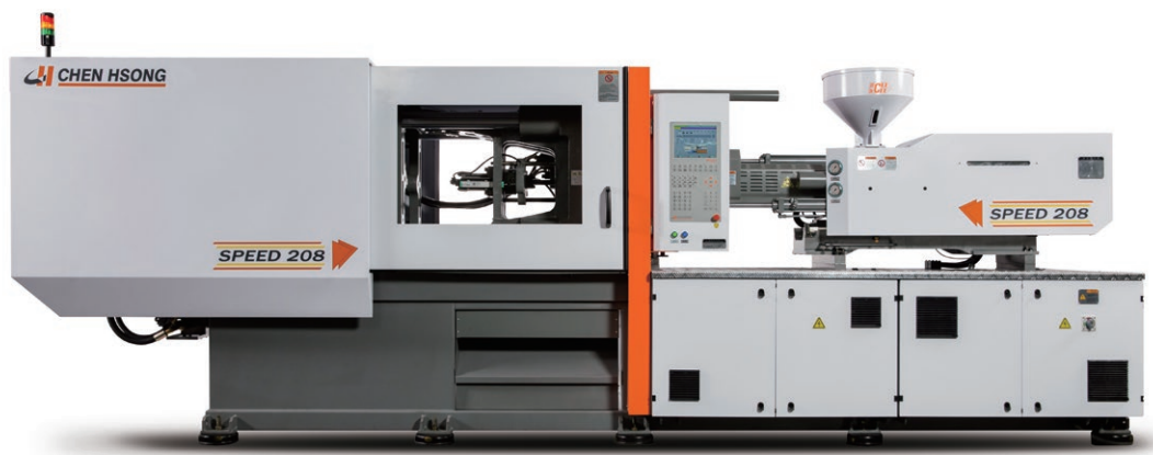
SPEED伺服驅動節能高速注塑機 SPEED Servo Drive High-speed Injection Moulding Machine

During this financial year, the Group's new, "Sixth-Generation" MK6 (Mark-Six) series of injection moulding machines, which were based on Japanese technology, continued to garner significant market praises, with close to 700 sets sold by the end of this financial year and projected to break through 1,000 sets by May 2017 – an extremely encouraging rate of take-up. The MK6, product of years of R&D investments by the Group yielding high return, is an all-rounding performer with superior stability and price-performance ratio, achieving a "repeat-order ratio" (i.e. the portion of customers purchasing the MK6 and coming back for new purchases) that was the highest in recent history of the Group. Within a very short period of time, this product line will become the Group's new star product, and is expected to gain substantial market share in the future.