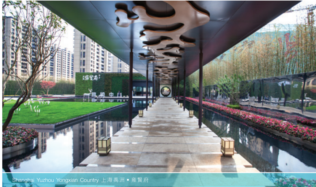
Shanghai Yuzhou Yongxian Country 上海禹洲·雍賢府