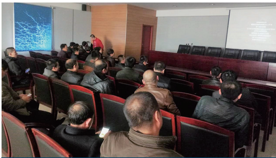
The training 培訓現場情況

隨著本集團不斷發展，為確保團隊質素不斷提升，我們將增加員工接受培訓的機會，並不斷檢視及改進培訓課程，使其配合業務營運及員工的需要。