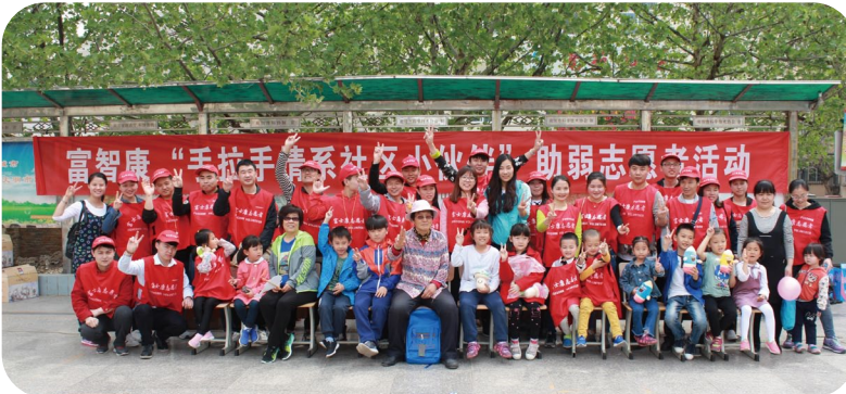
Volunteering event on Chinese National Action Day for "Hand-in-hand Poverty Alleviation"