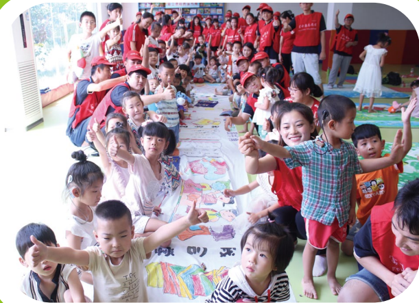
Fun day with children at the Ruicong Rehabilitation Center for Deaf Children