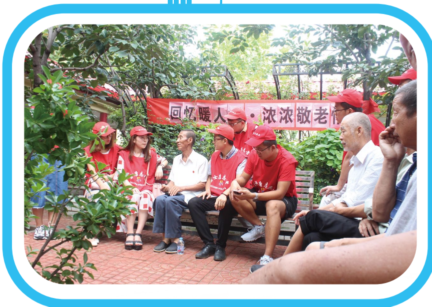
Visit to Longhe Elderly Home