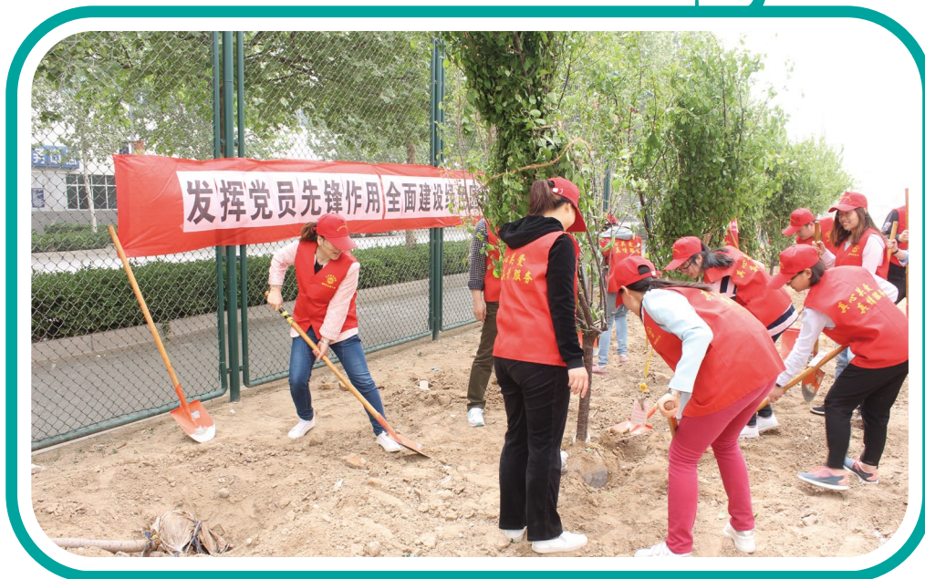
Tree planting activity at the Langfang, PRC facilities