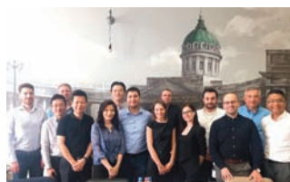
Technology and Knowledge Exchange Workshop 技術及知識交流工作坊