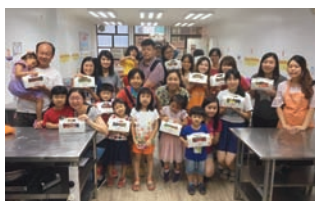
Summer Baking Workshop 暑期烘焙班