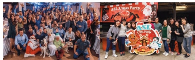
Christmas Party 聖誕派對