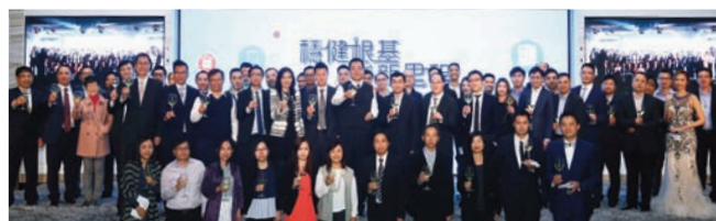
Celebrates ASL's 20th listing anniversary with employees 與員工慶祝自動系統上市二十周年