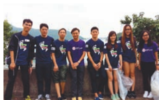
Tung Chung Family Walk 2017 東涌健步行2017