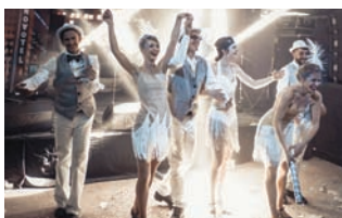
New Year Party 新年派對