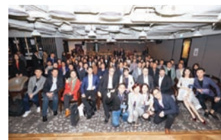
Sponsors the Hong Kong International Entrepreneurs Festival 2017 贊助「香港國際創客節2017」