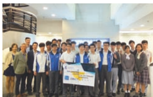
IT Exploration Tour for Secondary Students 中學生IT體驗團