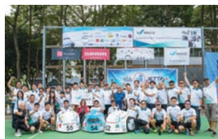
Sponsors the 31st Annual Hong Kong 24 Hour Pedal Kart Grand Prix 贊助「第三十一屆香港24小時慈 善腳踏車格蘭披治大賽」