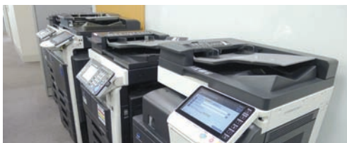
Cloud Printing Project 雲端打印項目