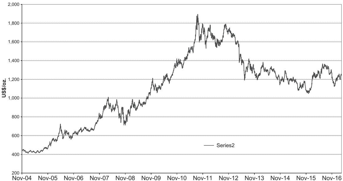
Daily gold price - November 18, 2004 to March 31, 2017

The following chart provides historical background on the price of gold. The chart illustrates movements in the price of gold in U.S. dollars per ounce over the period from the day the Shares began trading on the NYSE on November 18, 2004 to March 31, 2017, and is based on the LBMA Gold Price PM when available from March 20, 2015 and previously the London PM Fix.