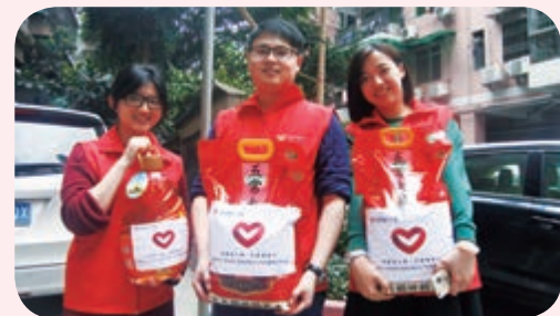
A voluntary action team from Guangzhou Regional Company