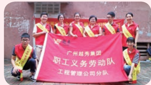
A voluntary action team from the project administration company