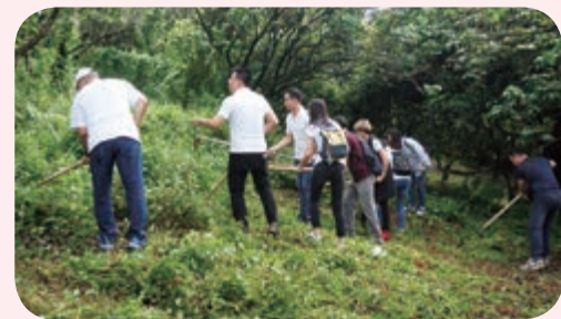
A voluntary action team from Xingye Company