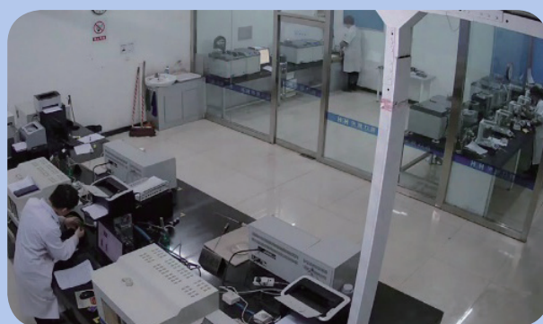
Monitoring over testing 對檢驗的監控