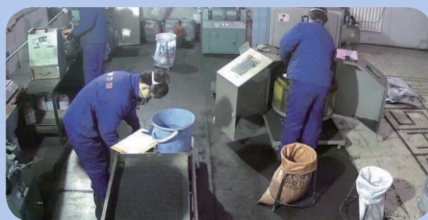
Monitoring over sample preparation 對樣品製備的監控