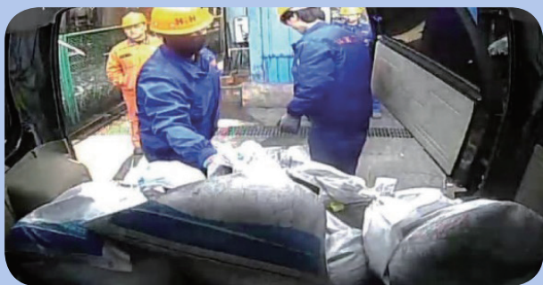
Monitoring over samples transportation 對樣品運輸的監控