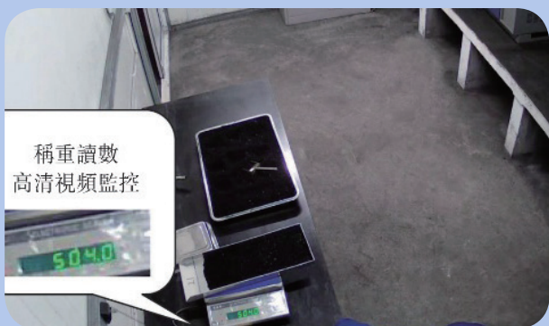
Monitoring over sample weighing 對樣品稱重的監控