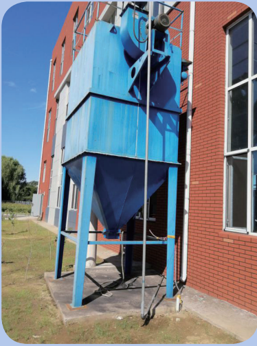
Dust removal equipment of sample preparation room 制樣室除煙塵設施

In addition, the Group's safety management system requires that considerations on occupational health and safety should be incorporated into supplier contracts, in order to effectively integrate supply chain management into safety culture and policies.