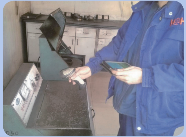
Device recording at sample preparation 樣品製備設備記錄