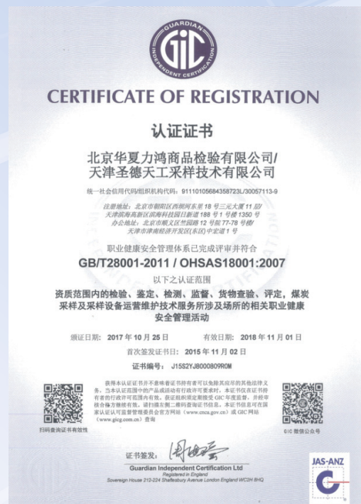
Certificate of GB/T28001-2011/OHSAS18001:2007 GB/T28001-2011/OHSAS18001:2007認證證書

本集團視僱員為最寶貴的資產。多年來，我們致力於為僱員營造安全健康的工作環境，已取得ISO14001環境管理體系和OHSAS18001職業健康安全管理体系的認證（詳見下圖），並通過完善的安全培訓機制，確保僱員在各業務領域的工作中保持身心健康。本年度內，我們未曾發生因工作事故而死亡的事件。