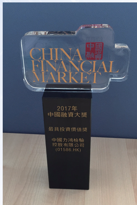
The trophy of “2017 China Financial Market Award • Most Valuable Investment Award” 「2017年中國融資大獎：最具投資價值獎」獎盃

在2017年度本集團共榮獲「2017年中國融資大獎」、「高新技術企業」、「中國質量檢驗協會煤炭專業委員會副理事長單位」等8項獎項及榮譽，從側面反映出我們對利益相關方期望的積極回應。