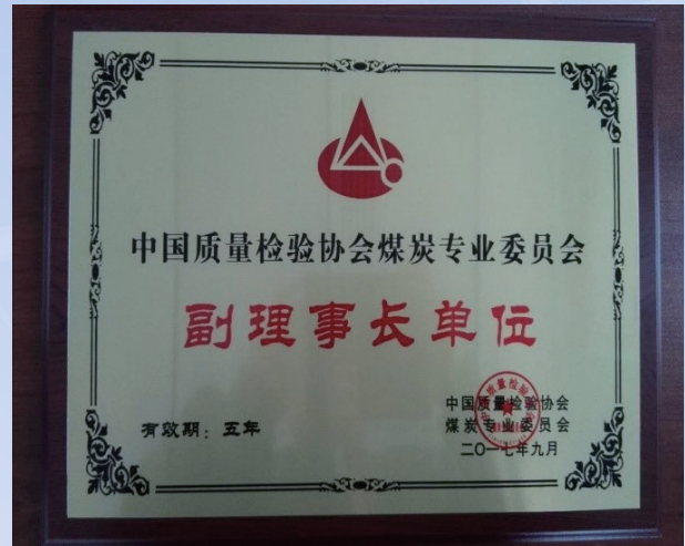
The Certificate of “Vice Director of Professional Committee of Coal Industry of China Association for Quality Inspection” 「中國質量檢驗協會煤炭專業委員會副理事長單位」榮譽證書