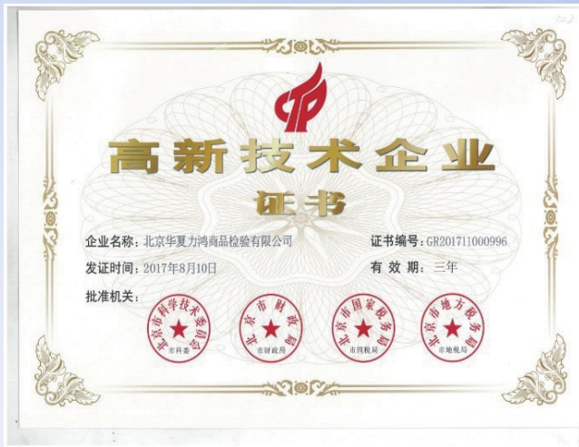
The Certificate of “High and New Technology Enterprise” 「高新技術企業」榮譽證書