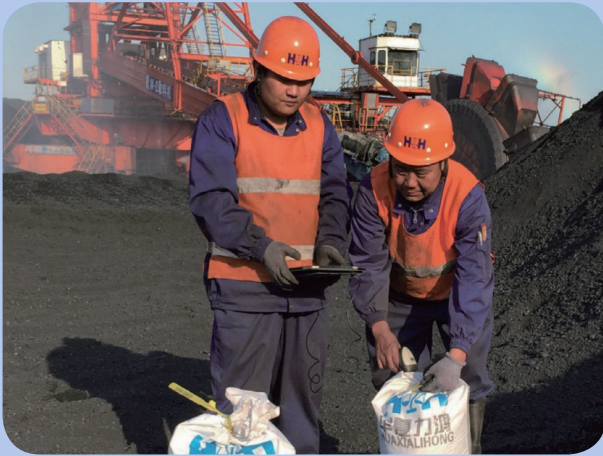
Security code affixation and recording at on-site sampling 現場採樣時貼上安全代碼並進行記錄