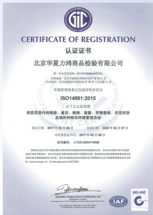
Certificate of ISO14001:2015 ISO14001:2015認證證書

The Group regards employees as its most valuable asset. Over the years, we have been committed to creating a safe and healthy working environment for our employees. We have obtained the certificates of ISO 14001 Environmental Management System and OHSAS 18001 Occupational Health and Safety Management System (see the figures below for details). And through a sound safety training mechanism, it is able to ensure that employees maintain their physical and mental health in every operation position. During the Reporting Period, we did not occur any death cases due to work accidents.