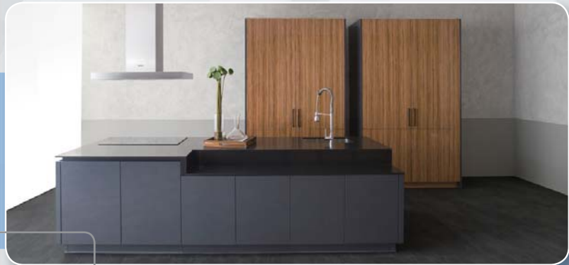
TOTO Sanitary Wares and Kitchen Cabinets TOTO 衛浴潔具及廚櫃