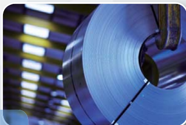
Surface Critical Coil Solutions 卷鋼加工方案