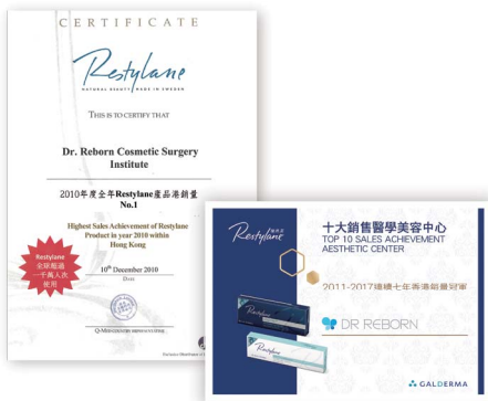
Restylane — Highest Sales Achievement for Consecutive 7 Years from 2011 to 2017 within Hong Kong Restylane — 2011–2017 連續 7 年全港銷量冠軍