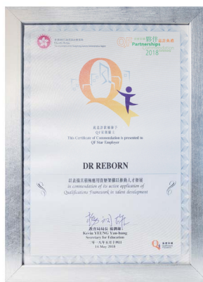
QF Partnerships Commendation Ceremony 2018 — QF Star Employer 資歷架構夥伴嘉許典禮 2018 — QF 星級僱主