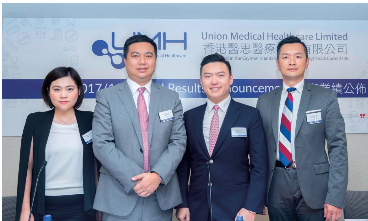
2017/18 Annual Results Announcement 2017/18年度業績公佈