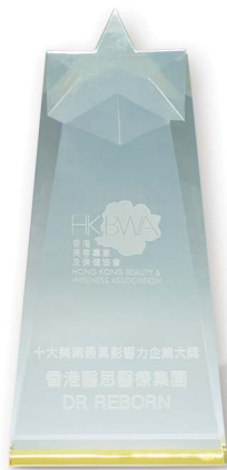
Hong Kong Beauty & Wellness Association — Top 10 Most Influential Brands of Beauty Industry 2017 香港美容專家及保健協會 — 2017年美容業十大最有影響力品牌