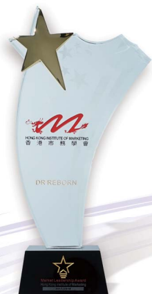
Hong Kong Institute of Marketing — Market Leadership Award 2017 香港市務學會 — 2017年市場領導獎