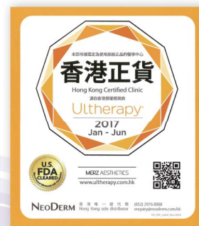
Merz Aesthetics — Golden Records Award Year 2017 for Ultherapy 香港正貨 — 2017年Ultherapy記錄金獎