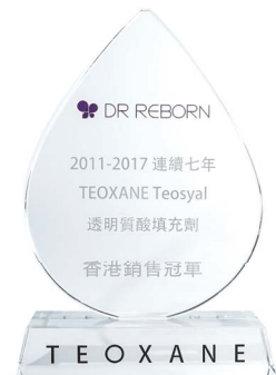
Teosyal — Highest Sales Achievement for Consecutive 7 Years from 2011 to 2017 within Hong Kong Teosyal — 2011–2017 連續 7 年全港銷量冠軍