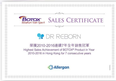
Botox — Highest Sales Achievement for Consecutive 7 Years from 2010 to 2016 within Hong Kong Botox — 2010–2016 連續 7 年全港銷售冠軍