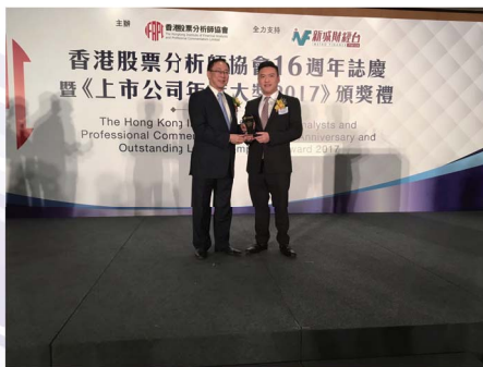
The Hong Kong Institute of Financial Analysts and Professional Commentators Limited 16th Anniversary — Outstanding Listed Companies Award 2017 香港股票分析協會 16週年誌慶暨上市公司 年度大獎 2017 頒獎禮