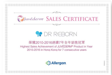
Juvederm — Highest Sales Achievement for Consecutive 7 Years from 2010 to 2016 within Hong Kong Juvederm — 2010–2016 連續 7 年全港銷售冠軍