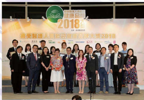
The Most Popular Medical Brands voted by Medical Staffs Award 2018 最受醫護人員歡迎品牌大獎 2018