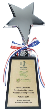
Green Office and Eco-Healthy Workplace Awards Labelling Scheme 世界綠色組織 — 2017年辦公室獎