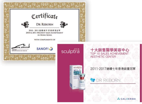
Sculptra — Highest Sales Achievement for Consecutive 7 Years from 2011 to 2017 within Hong Kong Sculptra — 2011–2017 連續 7 年全港銷量冠軍