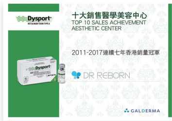
Dysport — Highest Sales Achievement for Consecutive 7 Years from 2011 to 2017 within Hong Kong Dysport — 2011–2017 連續 7 年全港銷量冠軍