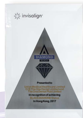
Black Diamond Status — 2017 Invisalign Advantage Program in Hong Kong 黑鑽供應商 — 2017 年香港隱適美優勢項目

Highest Sales Achievement for Consecutive 10 years within Hong Kong 高達連續 10 年 全港 銷量冠軍