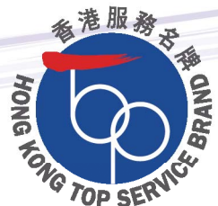
Hong Kong Top Service Brand 2017 2017年香港服務名牌