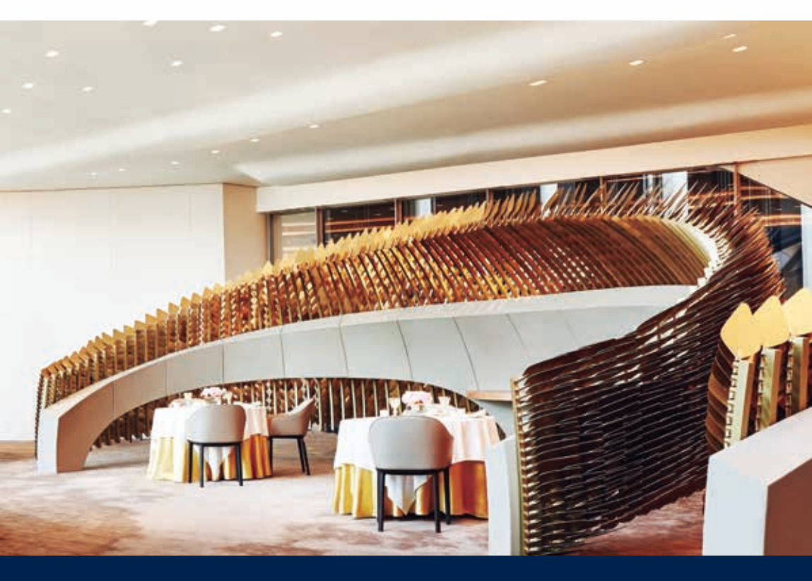
Yi at Morpheus is Asia's only fine-dining restaurant offering regional Chinese cuisine served omakase-style.

In the first half of 2018, Altira Macau recorded strong year-on-year improvement in Adjusted property EBITDA as a result of better performance in all gaming segments.