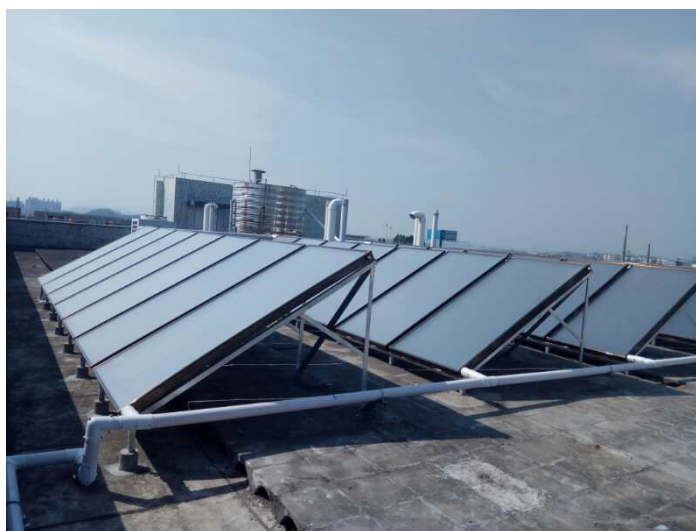
Jiangmen Factory – solar heating system