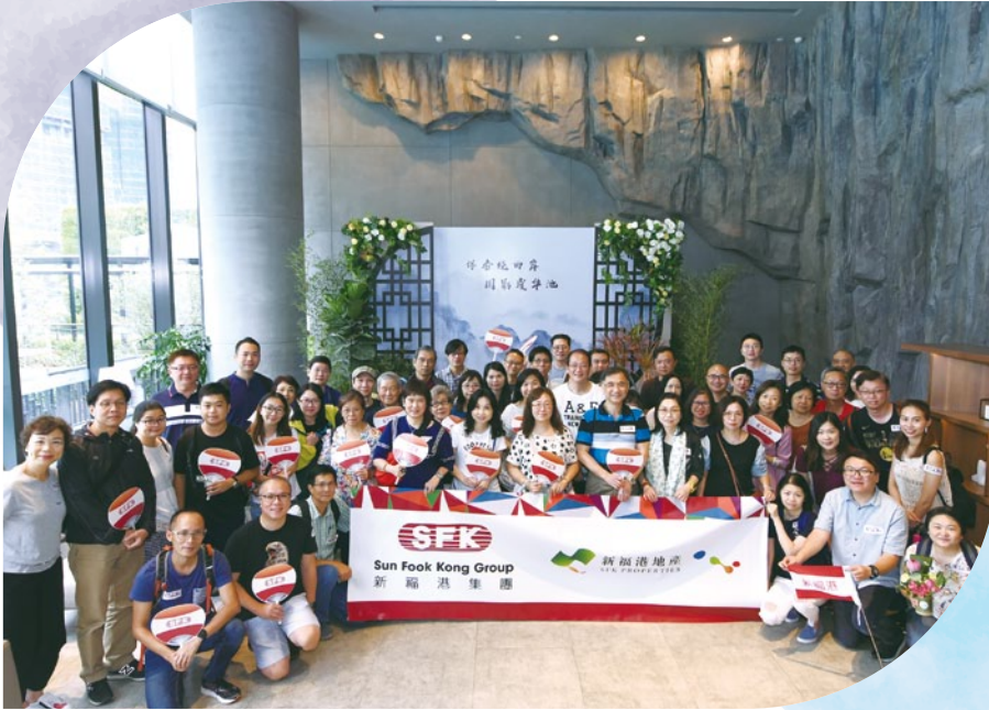
SFK staff and their family members participated in "The Paramount" Foshan visiting tour 新福港同事帶同家庭成員一起參加佛山市「新福港鼎峰華庭」項目參觀訪問團

With prudent monitoring and control, and through diligent management and training, we strive to minimise and mitigate environmental pollution and nuisance caused to the public in the vicinity of our project sites, and make zero compromise in occupational health and safety. We are delighted to say that our sustained efforts in these respect have been recognised with social responsibility awards issued by various authorities and associations.