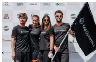
SPB Sport Teams SPB 運動隊伍