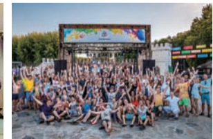
Saratov Summer Party 薩拉托夫夏日派對