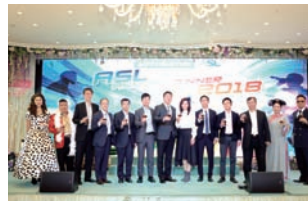
Annual Dinner 員工周年晚宴