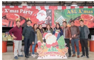
Christmas Party 聖誕派對