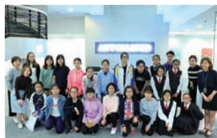
Girls Go Tech Mobile Classroom Girls Go Tech 流動教室