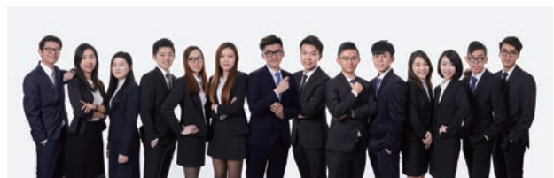
Graduate Trainees 畢業實習生