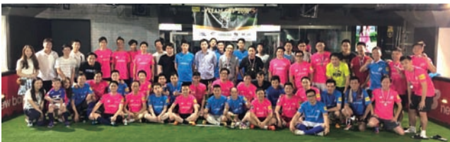
Championship in the Veeam Cup 2018 榮膺 Veeam 足球比賽 2018 冠軍