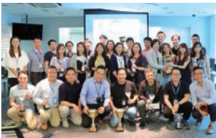
Staff Award of Excellence 傑出員工獎勵計劃