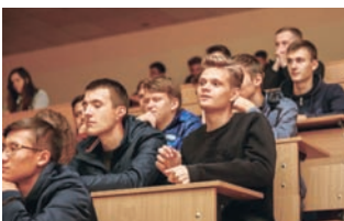
Public Talk for University Students 給大學生的公開講座