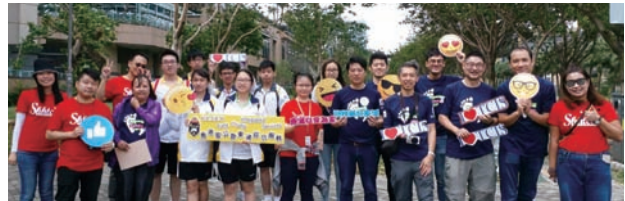
Tung Chung Family Walk 2018 東涌健步行 2018