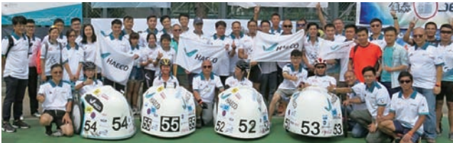
Sponsors the 32nd Annual Hong Kong Charity 24 Hour Pedal Kart Grand Prix 贊助「第三十二屆香港 24 小時慈善腳踏車格蘭披治大賽」

自動系統致力通過舉辦各種活動來關懷社區、員工和環境，包括安排學生參觀辦公室、綠色步行、慈善賽車、足球比賽、員工獎勵和培訓計劃、夏季派對、聖誕派對和周年晚宴聚會等。