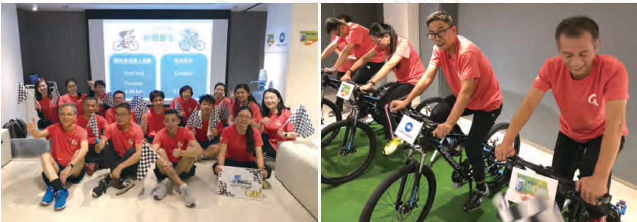
Konica Minolta Green Concert “Extreme Power Generating Challenge” joined by Hong Kong Headquarter 香港總部參與「柯尼卡美能達綠色音樂會」暨「格蘭披治單車賽」

再者，我們安排多項綠色活動，倡導員工培養愛護環境的生活方式。有關活動包括綠領行動的「利是封回收重用大行動」、世界自然基金會的「地球一小時」、香港中華基督教青年會的「無膠樽日」和環保觸覺的「無冷氣夜」等。同事們從活動中得到體驗，認識到不同的環保生活方式，還樂於與親友分享他們的新知識。