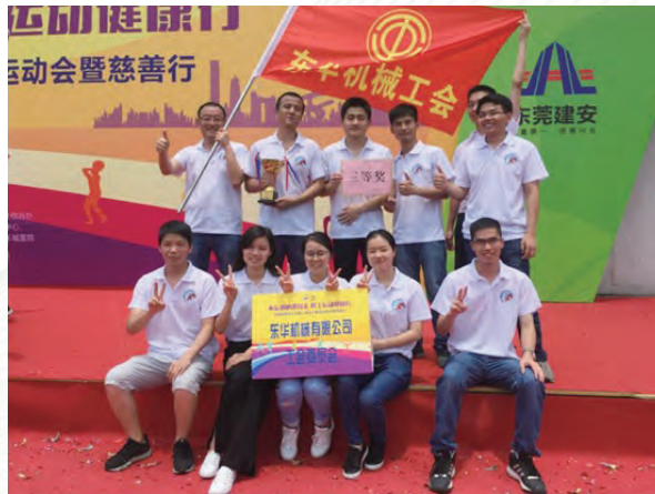
10 Representatives from Dong Hua at the Third Session Worker Sports Fair and Charity Walk 十名東華代表參與第三屆職工趣味運動會暨慈善行

除此之外，我們也經常舉辦消閒活動讓員工工作息平衡，其中康體活動是一大重點，例如：足球、跑步及運動日等。二零一八年，東華派出十位代表參加東莞「職工趣味運動會暨慈善行」，奪得總體表現季軍殊榮。