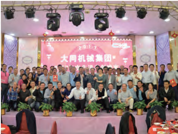
2017 Annual Dinner and Awards Ceremony 二零一七周年晚宴暨頒獎典禮

我們致力提倡作息平衡的健康生活。於本年度我們舉辦各式各樣的聯誼活動，促進同事們的身心健康，包括每月生日會、父親節和母親節及其他節慶活動。在二零一八年三月八日，東華安排了一次外遊感謝員工辛勤工作，八十位員工及其家人暢遊龍鳳山莊影視度假村，度過愉快的一天。