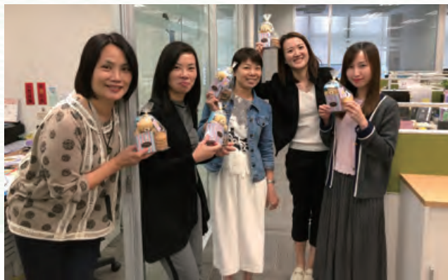
Flag selling day at our Hong Kong Headquarter in support of Fu Hong Society 香港總部舉行賣旗日支持扶康會

我們熱心推廣及參與社區計劃，推動本集團業務和社會的可持續發展。我們的員工組成義工隊積極參與各類慈善活動，並為有需要的人士籌募善款和物資。二零一八年，香港員工合共提供了44小時義工服務，並本公司與香港員工捐獻約36,000港元支持多間本地慈善機構，亦熱心響應扶康會主辦的「樂建共融 Walk • In 綠色市集暨步行籌款」活動，贊助三箱廚具產品。