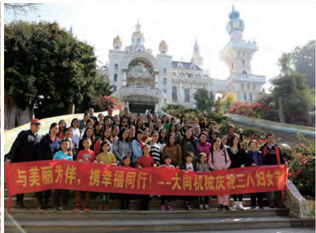
Dong Hua Women's Day "Thank You" Trip 東華在三八婦女節舉辦旅遊活動答謝員工