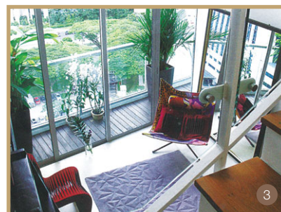
1. Dakota Residences 2&3. Southbank Soho

The Group's Singapore property portfolio is concentrated in locations near Mass Rapid Transit (MRT) stations, Singapore's railway system, ensuring convenience and connectivity. The Group owns a portfolio of SOHO units at Southbank which features high-ceilings and duplexes. These units are uniquely zoned for both residential and commercial uses and hence generate strong rental yield. The Group also owns a portfolio of residential properties at Dakota Residences adjacent to the Dakota MRT station.