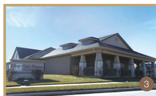
3. Glen Carr House, senior housing communities