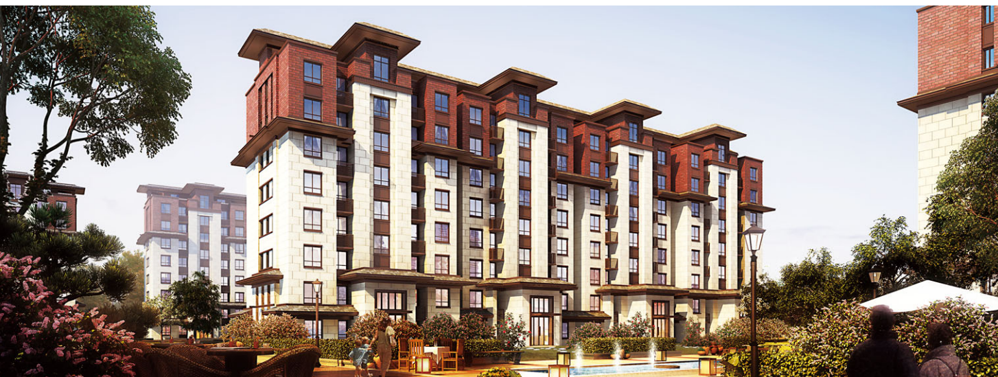
Zhengzhou Zensun River Valley 鄭州正商河峪州

Looking back to 2018, the Group had made further development with high-quality construction achieving remarkable results as they were highly recognized by customers and business partners. During the financial year ended 31 December 2018, the Group recorded revenue of approximately RMB601.5 million, representing a decrease of approximately 45% over last year, and gross profit of approximately RMB275.1 million, representing a decrease of approximately 25% over last year. With the Group's prevailing development strategy of providing "High quality (高品質)" products to the customers, where most of the Group's property development projects are designed to be delivered with full refurbishment. As such, there was no delivery of newly completed property development projects for the Group in 2018 as a longer development schedule was required for full refurbishment arrangement. In spite of the decrease in the Group's revenue and gross profit in 2018, our management remains full confidence in our performance in 2019, as certain property projects are expected to be completed and delivered in the year of 2019.