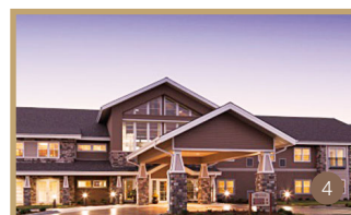
4. Oxford Grand McKinney, senior housing communities

The Group owns about 16 Single Family Rentals (“SFRs”) located in Texas, Florida and Georgia through its REIT subsidiary, AHR (with total lettable area of approximately 32,004 sq. ft.). These SFRs are carefully selected for their location, condition, tenant profile and potential for capital appreciation. Further to the SFRs, two senior housing communities (one in Texas and one in Kansas) with total area of approximately 98,700 sq.ft. were acquired by AHR’s subsidiary. The Group also owns freehold land parcels with approximately 273,200 sq. m. in California and two residential units situated on Wall Street in New York.