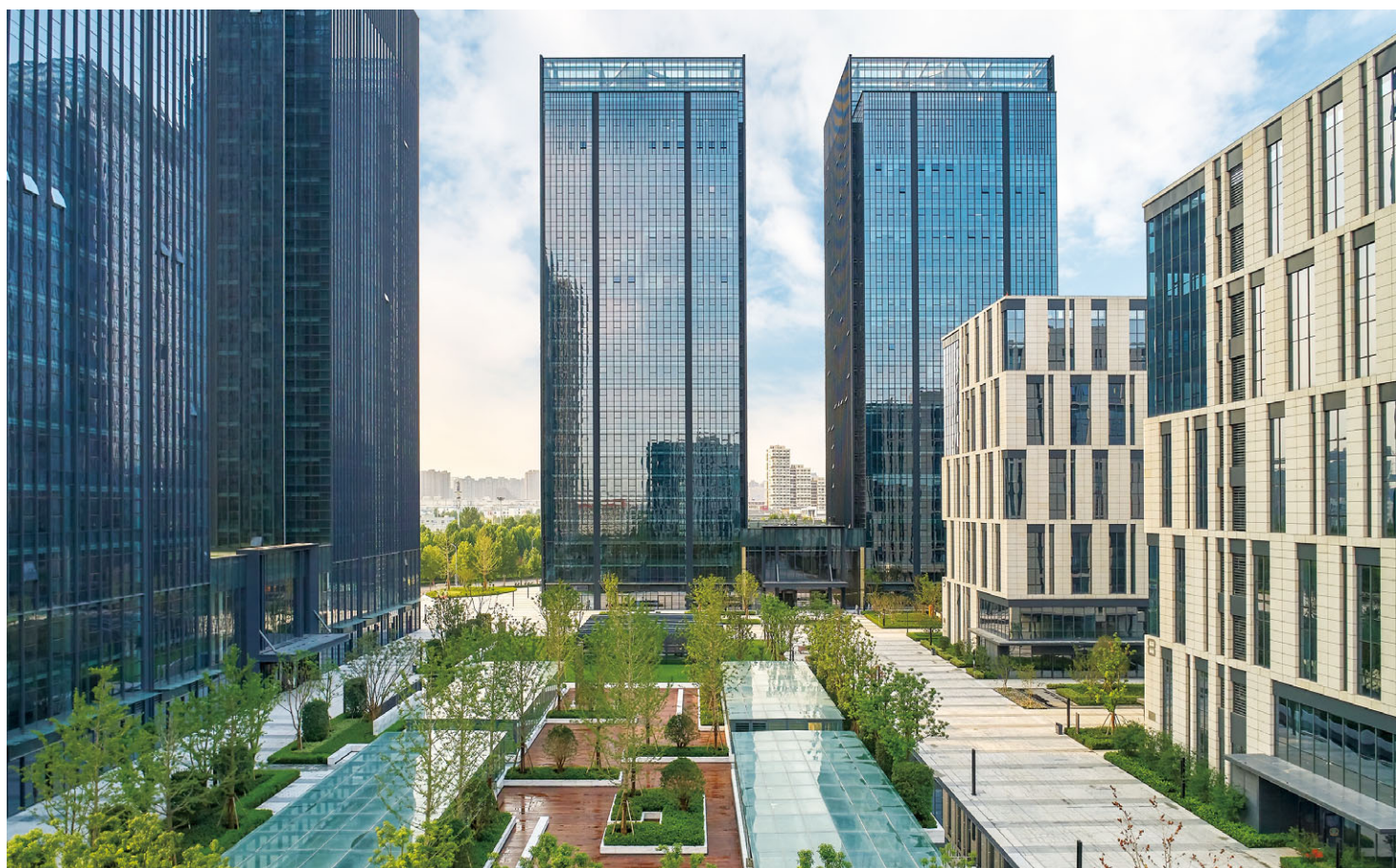
Zensun Jingkai Plaza 正商經開廣場

本公司總部位於香港，辦事處遍佈日本及美國(「美國」)。其於新加坡、香港、日本、美國及中華人民共和國(「中國」)擁有規模龐大之物業組合。本集團主要於中國、香港及海外從事物業發展、物業投資及管理、酒店營運以及證券買賣及投資。本集團目前專注尋求發展兩個增長據點，即於中國進行之房地產發展擴張及於美國進行之房地產投資信託(「房地產投資信託」)擁有及管理策略(「房地產投資信託策略」)。