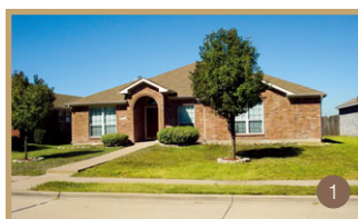
1&2. Single Family Rentals