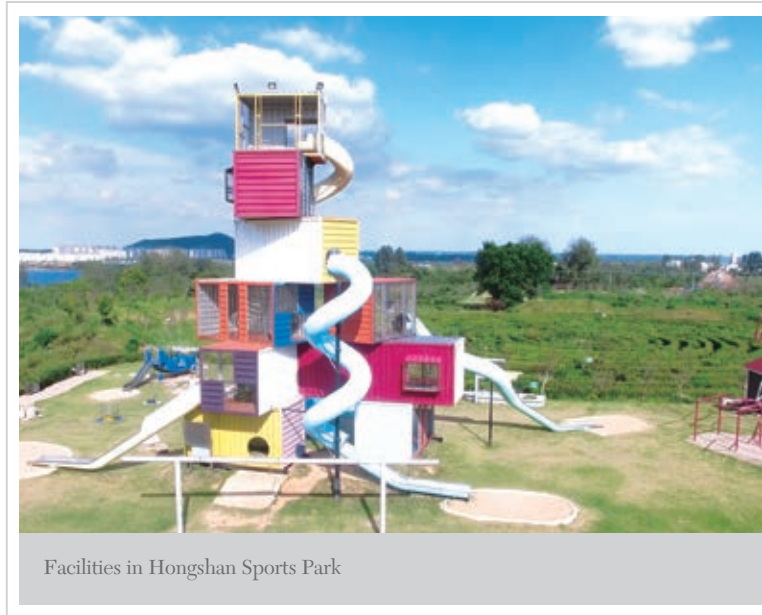
Facilities in Hongshan Sports Park