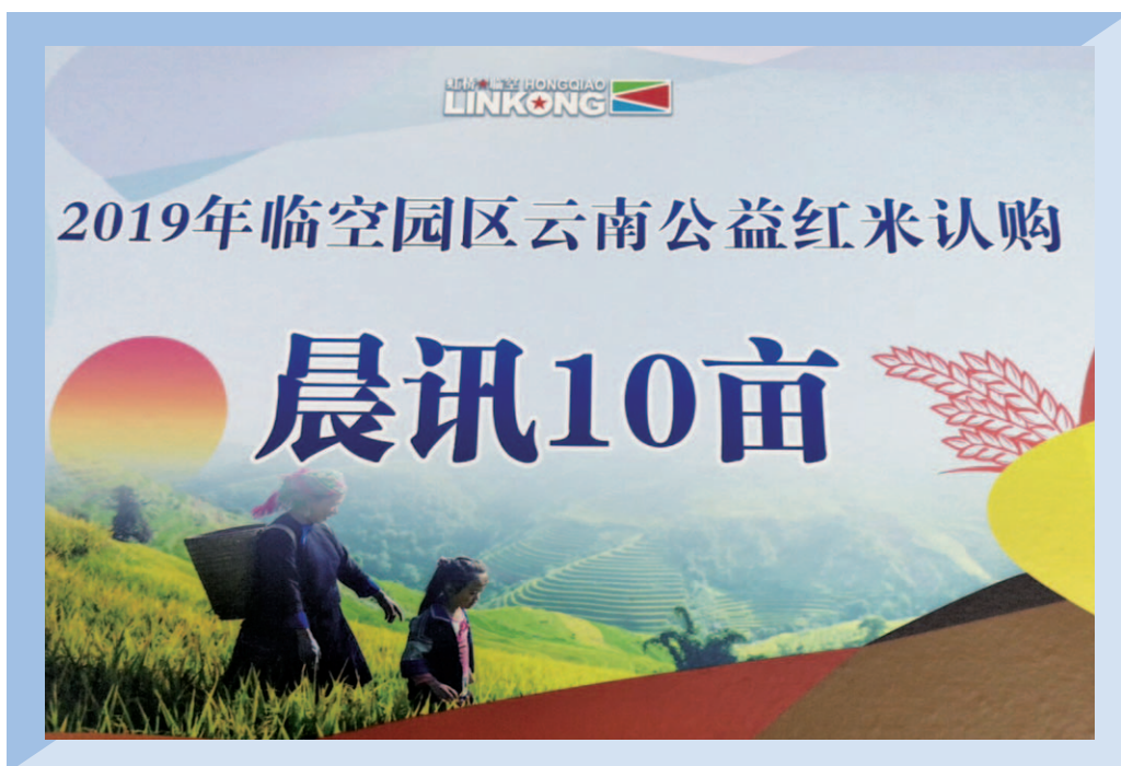
雲南紅米認領活動 Bought black sticky rice from Yunnan activity