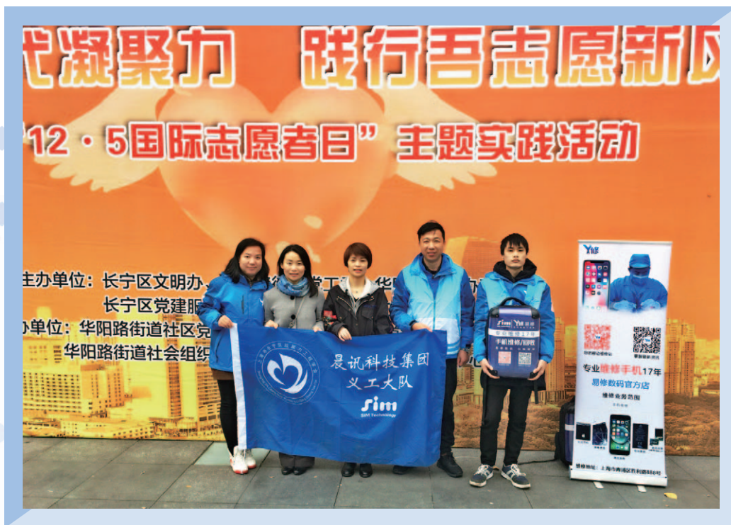
12.5 國際志願者日 12.5 International Volunteers Day