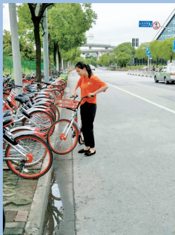
Bike sharing volunteer activity 文明騎行志願者活動

本集團長期以來一直致力為社區服務。本集團積極主動參與社會、社區活動、成為社會大家庭積極的一分子。本集團董事會主席楊文瑛女士榮獲中華人民共和國民政部頒發的「中華慈善獎」，以表彰其支持社區的傑出成就。於二零一八年，本集團員工共提供了140小時的社區服務，並積極參與社會公益慈善活動包括文明騎行志願者活動、12.5國際志願者日、為自閉症兒童服務自願者活動、雲南紅米認領和捐贈生態田活動、以及積極參與社區組織的各項文體活動。本集團亦鼓勵員工參與其他社區服務活動。