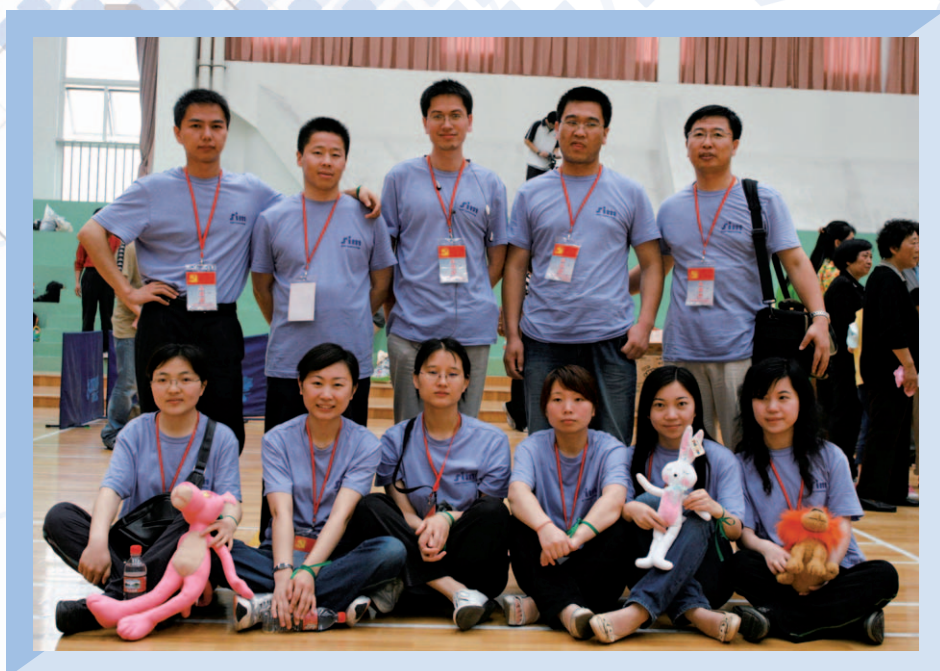
為自閉症兒童服務自願者活動 Serving children with autism volunteer activity