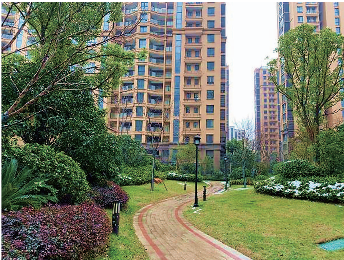
The podium garden of the Cullinan Bay project

In Year 2018, the Group engaged an independent third party to conduct pre-acceptance work for construction completion and environment protection to buildings no. 5, 6, 10, 16, 17 and the basement project no. 2 of Phase 2 of the Cullinan Bay project, and to issue the Investigation Report on Pre-acceptance and Inspection of Construction Completion and Environment Protection* (竣工環境保護預驗收監測調查報告). As indicated by the report, the greening ratio of the Cullinan Bay project reaches 35%, higher than the requirement of 30% provided in the Standard for Greening of Residential District and Institutions in Jiangsu Province (江蘇省城市居住區和單位綠化標準) (DB32/139-95).