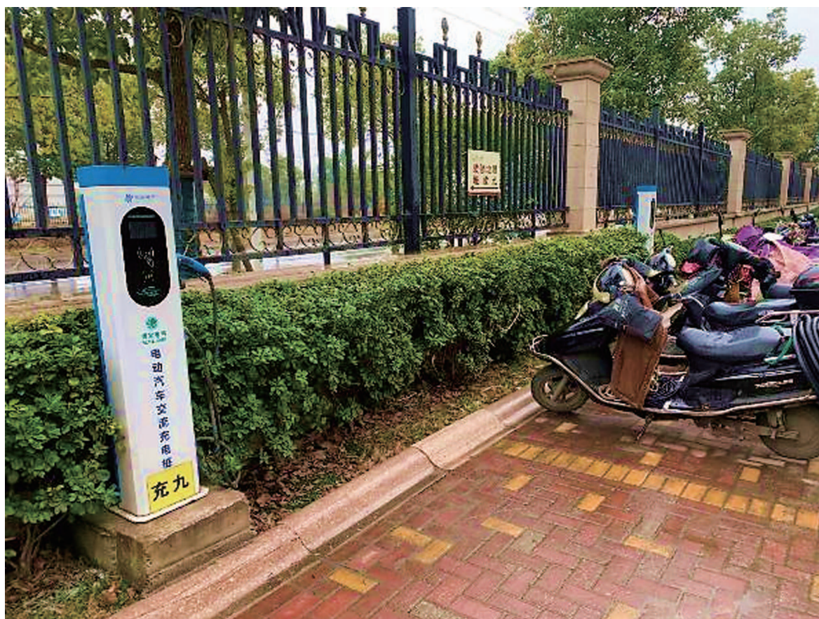
EV AC charging points located at the Cullinan Bay project