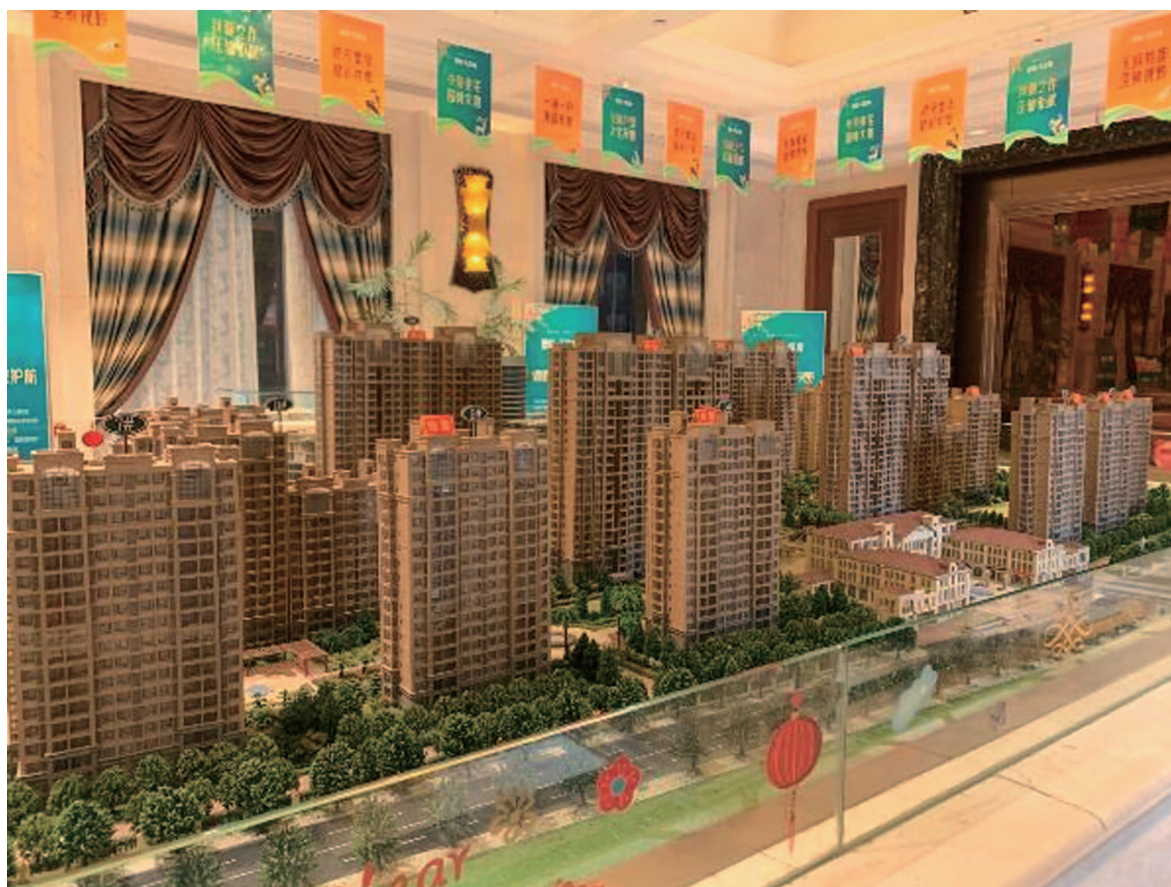
The development project model displayed in the Cullinan Bay project sale office.

In Year 2018, the Group was not aware of any material non-compliance with relevant rules and regulations relating to health and safety, advertising, labeling and privacy matters relating to products provided and methods of redress that have a significant impact. The Group strictly complied with local laws and regulations relating to product responsibility, such as Advertising Law of the People's Republic of China. In addition, there was no report of significant fines in Year 2018.