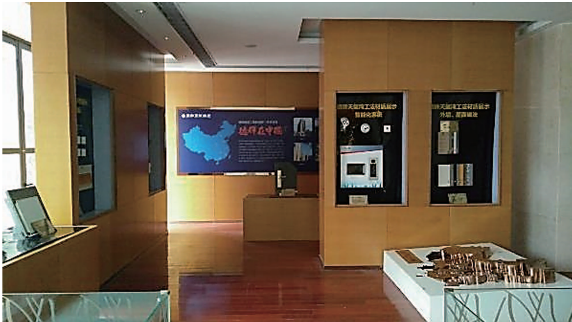
Construction materials used in the development project displayed in the Cullinan Bay project sale office