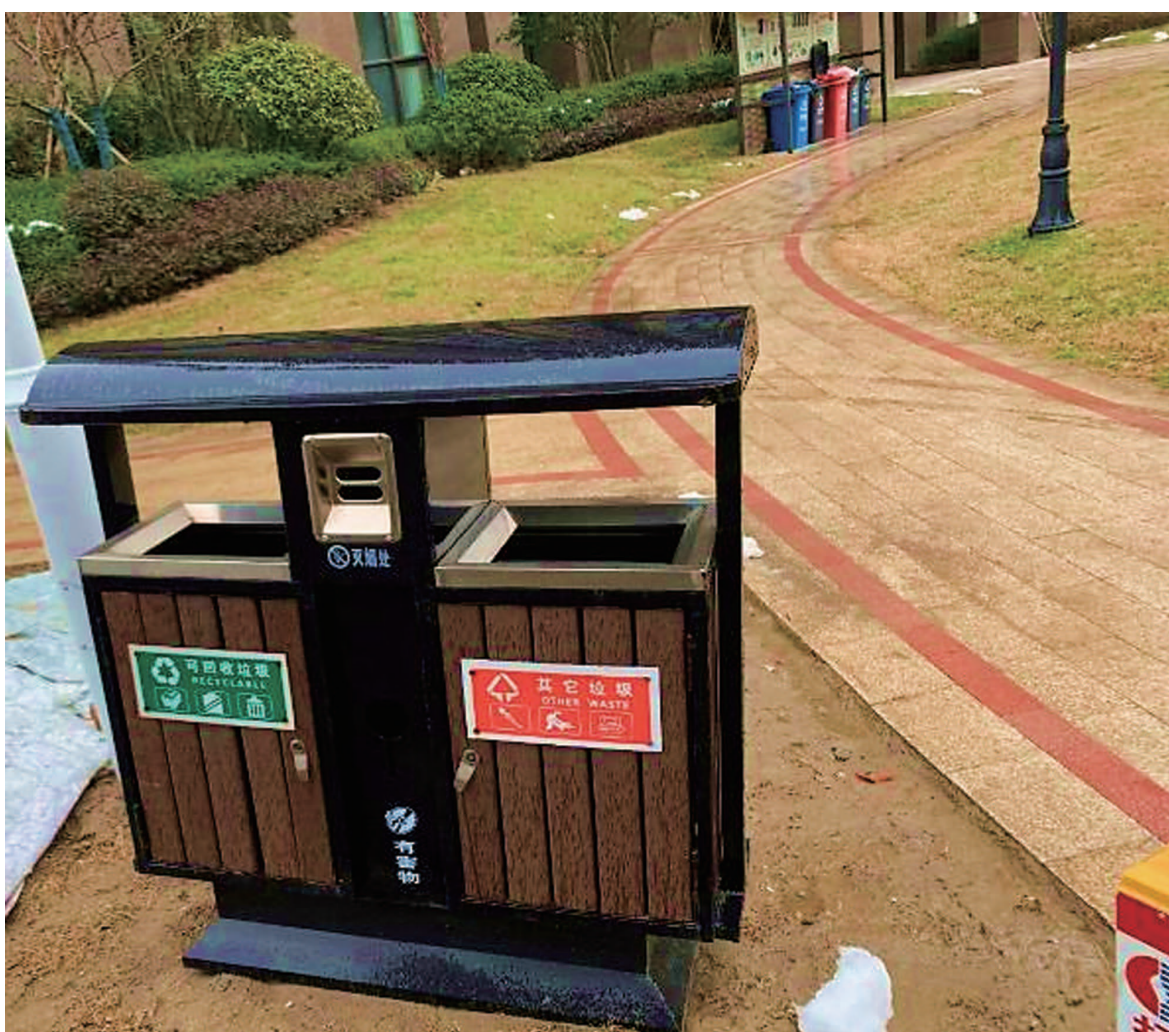
Outdoor bins with sorting function to categorize garbage into recyclable/unrecyclable/hazardous waste

Note 1: The Group generated only an insignificant amount of hazardous waste, which did not have any substantial impact to the environment; therefore, no data in this aspect was disclosed.