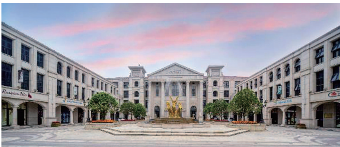
The Cullinan Bay project in Yangzhou, Jiangsu Province

In Year 2018, the Company, through its subsidiary, Yangzhou Dehui Real Estate Development Company Limited (“Yangzhou Dehui”), continued to develop The Cullinan Bay project and sell and pre-sell its properties. Since Yangzhou Dehui is the only subsidiary of the Group that has a higher impact on the environment, society and governance, therefore this report will focus on the detailed disclosure on the environmental, social and governance policies and the relevant performances of Yangzhou Dehui in Year 2018.