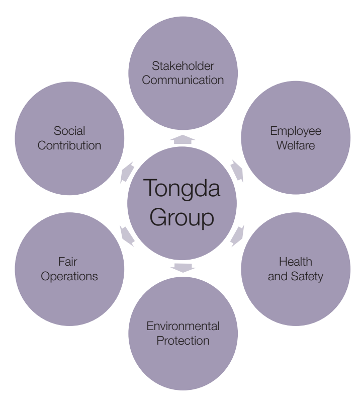
Tongda Group's CSR Model

The ESG Report spans for the period from 1 January 2018 to 31 December 2018, and covers information of the Group – Hong Kong headquarters and its production bases in China, such as Shishi (石獅), Xiamen (廈門), Shenzhen Baoan (深圳寶安), Shenzhen Shajin (深圳沙井), Nanan (南安) and Shanghai (上海). The ESG Report provides detailed explanation with regard to the Group's CSR model, shown in below, on different aspects, including working environment quality, employee welfare and training, health and safety, environmental protection, operating practices, community involvement and stakeholder communication. Throughout the ESG Report, the term "Group" refers to Tongda Group Holdings Limited and its subsidiaries, unless otherwise stated.