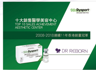
Dysport — Highest Sales Achievement for Consecutive 11 Years from 2008 to 2018 within Hong Kong Dysport — 2008–2018 連續 11 年全港銷量冠軍