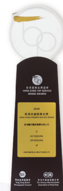
Hong Kong Premier Service Brand 2018 — 2018 香港卓越服務品牌