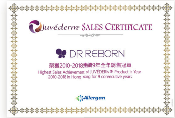
Juvéderm — Highest Sales Achievement for Consecutive 9 Years from 2010 to 2018 within Hong Kong Juvéderm — 2010–2018 連續 9 年全港銷售冠軍