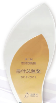
Road Show China 2018-2019 The Best Investor Relations Director — 2018-2019 第二屆中國卓越IR最 佳總監獎