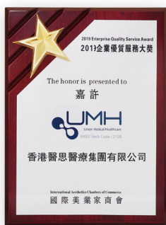
International Aesthetics Chambers of Commerce 2019 Enterprise Quality Service Award 國際美學業家商會 - 2019年企業 優質服務大獎