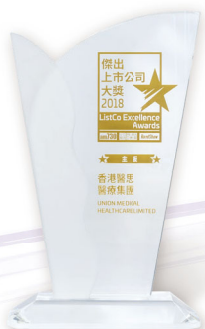
ListCo Excellence Awards 2018 2018 傑出上市公司大獎