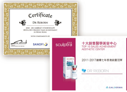
Sculptra — Highest Sales Achievement for Consecutive 8 Years from 2010 to 2017 within Hong Kong Sculptra — 2010–2017 連續 8 年全港銷量冠軍