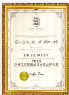
2018 The Most Outstanding Achievement Asian Beauty & Health Brand Award — 2018 亞洲美容健康最具成就品牌大獎