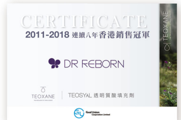
Teosyal — Highest Sales Achievement for Consecutive 8 Years from 2011 to 2018 within Hong Kong Teosyal — 2011–2018 連續 8 年全港銷量冠軍