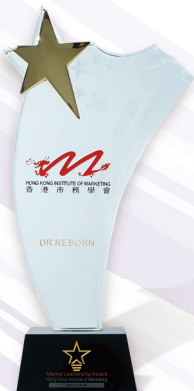
Hong Kong Institute of Marketing — Market Leadership Award 2018 香港市場學會 — 2018年市場 領導獎