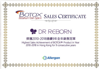
Botox — Highest Sales Achievement for Consecutive 9 Years from 2010 to 2018 within Hong Kong Botox — 2010–2018 連續 9 年全港銷售冠軍