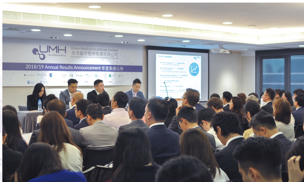
2018/19 Annual Results Announcement 2018/19年度業績公佈