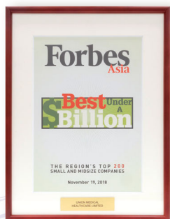
Forbes Asia Best Under A Billion The Region's Top 200 small and Midsize companies — 2018《福布斯》亞洲200強優秀 上市中小企業