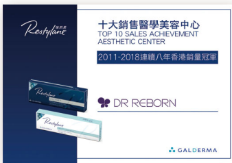
Restylane — Highest Sales Achievement for Consecutive 8 Years from 2011 to 2018 within Hong Kong Restylane — 2011–2018 連續 8 年全港銷量冠軍