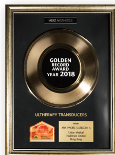
Merz Aesthetics — Golden Records Award Year 2018 for Ultherapy 香港正貨 — 2018 年 Ultherapy 記錄金獎