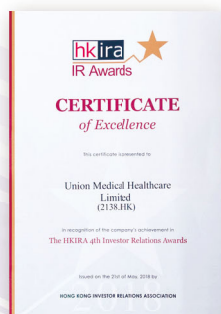
HKIRA 4th Investor Relations Awards — 香港投資者關係協會