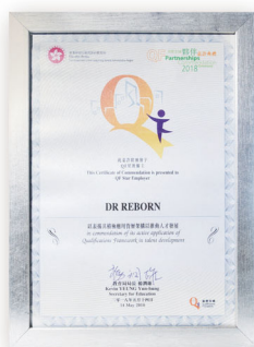
QF Partnerships Commendation Ceremony 2018 — QF Star Employer 資歷架構夥伴嘉許典禮 2018 — QF 星級僱主