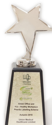
Green Office and Eco-Healthy Workplace Awards Labelling Scheme 世界綠色組織 — 2018年辦公室獎