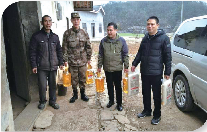
Poverty alleviation activities organized by Yichang Port in January 2019 於2019年1月宜昌港組織的精準扶貧活動