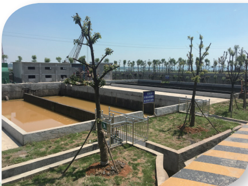
Sewage sediment tank at Yichang Port 位於宜昌港之污水沉澱池

除生活污水外，我們經營港口及物流的業務亦產生工業污水(如清洗堆場及機械的廢水)。我們已設立沉澱池和油水分離系統等污水處理設施，污水經處理後會循環再使用或合法地排放。在報告期間，我們旗下的嘉興內河國際碼頭已於港區設立污水接收裝置，以方便船舶於停泊期間，將船舶生活污水接駁至市政的污水管網進行排放。