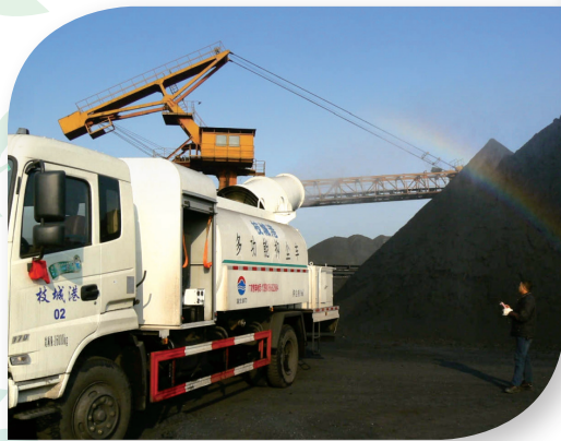
Newly acquired dust suppression trucks at Yichang Port 宜昌港新購的粉塵洗掃車