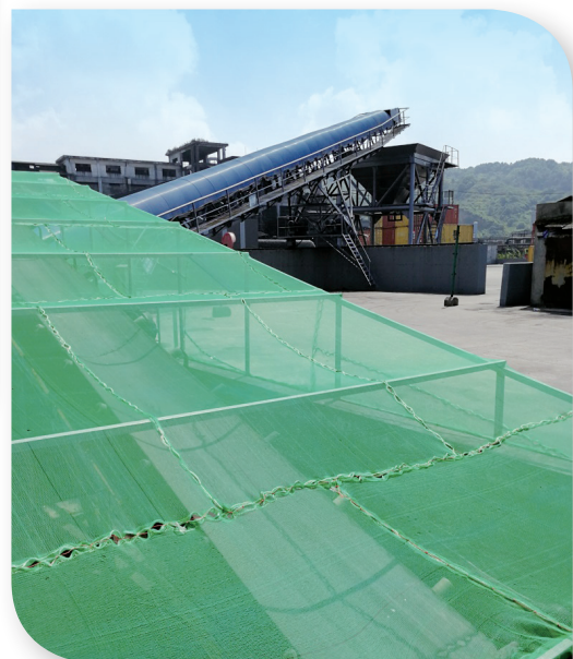
Fixed coal conveyor belts are covered up at Yichang Port 於宜昌港的固定煤炭傳輸帶進行遮蓋