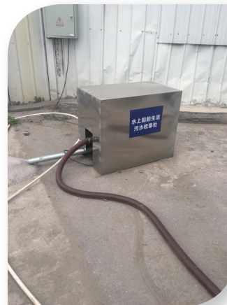
Cargo vessel sewage reception facility at Jiaxing International Feeder Port 位於嘉興國際內河碼頭的貨船污水接收裝置