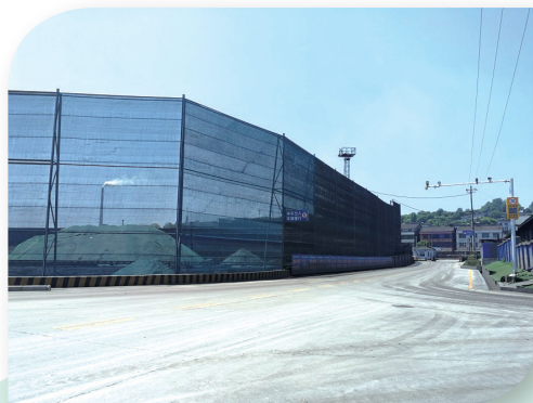
Windbreak and dust-controlling wall at stockyard of Yichang Port 設立於宜昌港散貨堆場的防風抑塵網