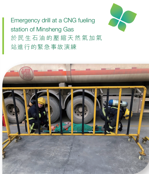
Emergency drill at a CNG fueling station of Minsheng Gas 於民生石油的壓縮天然氣加氣站進行的緊急事故演練

我們認識到職業健康與安全的重要性，並致力於為員工提供一個安全的工作環境，鼓勵安全操作並通過定期培訓和安全演練來增強員工的安全意識。