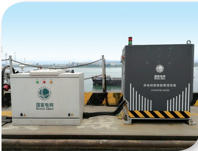
Shoreside electric power facilities at Yichang Port for moored cargo vessels 宜昌港為停泊岸邊之貨船提供電力接駁設施

在報告期間，我們於宜昌港的雲池碼頭安裝了岸邊電力設施，為鼓勵船舶在停泊時間關閉柴油發電機，以進一步控制港口區域的空氣污染。