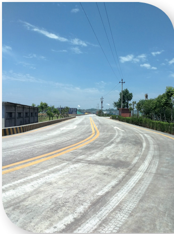
Clear traffic routes sign is implemented at Yichang Port 宜昌港實施明確的交通路線標誌

Vehicle speed monitoring system is implemented at Yichang Port 宜昌港實施車速監控系統