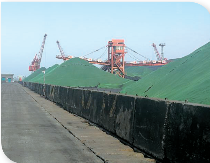
Covering stockpiles with tarps at the coal yard of Yichang Port 用防塵網覆蓋於宜昌港煤炭堆場的堆料

基於業務性質，港口及物流經營中會發現各種污染物來源，對空氣品質產生負面影響。例如船舶、貨車和貨物裝卸設備消耗燃料所產生的硫氧化物(SOx)和氮氧化物(NOx)。在港區範圍內和港區周邊，車輛、船舶、火車和貨物裝卸設備移動貨物過程中(特別是非集裝箱運輸的貨物)及固定源如儲存的煤堆都會產生粉塵和其他大氣懸浮顆粒。上述移動源的油品燃燒同時會產生一定的溫室氣體排放。