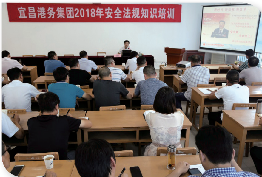
Training on work safety regulations at Yichang Port 於宜昌港進行有關安全法規之培訓