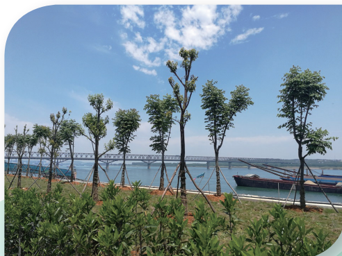
Greenery work at port operation area 港口作業區的綠化工作

保華致力於管理所有業務經營單位時保持對環境保護的敏銳觸覺。我們將不時審視我們的環境保護工作，且繼續在我們的經營中實施綠色生態環境的措施和常規。