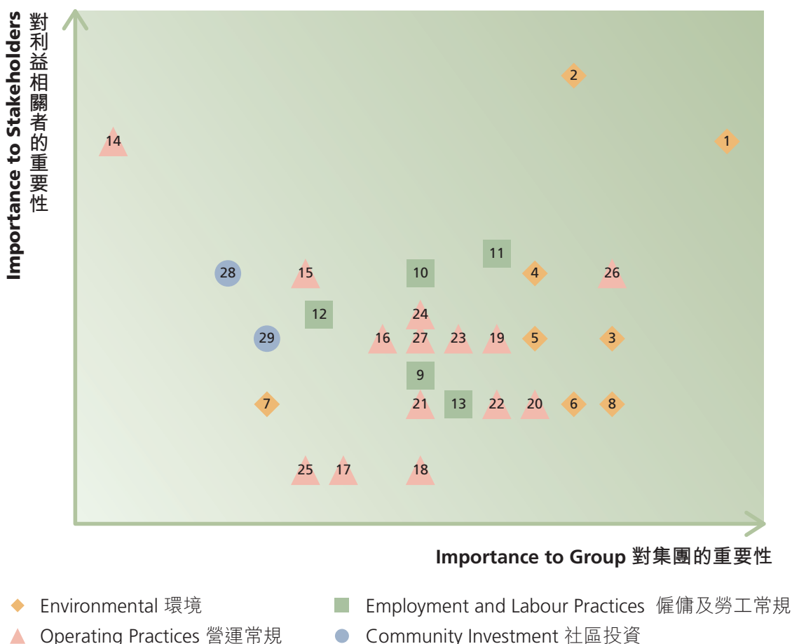
Stakeholder Engagement Materiality Matrix 重要性分析矩陣

由於集團的ESG風險因行業而異，並取決於公司的具體業務模式，因此本集團每年都會進行持份者參與調查，用以識別及瞭解其持份者對本集團在環境、社會與管治報告上的主要關注事項及重大利益。本集團已於二零一八財年度委託獨立第三方進行持份者參與重要性評估調查以確保調查的準確性與獨立性。本集團以持份者對本集團的影響及依賴程度為基礎，挑選出內部及外部持份者進行重要性評估調查。獲選的持份者通過網上調查的方式，就可持續性發展的議題表達意見及提出關注。本集團通過該調查選定對持份者和集團至關重要的可持續性議題。重要性評估調查結果如下圖所示。