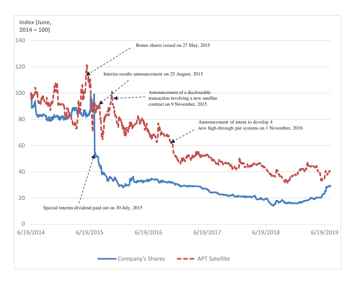
Chart 2 – Performance of the Shares compared APT Satellite in the past five years