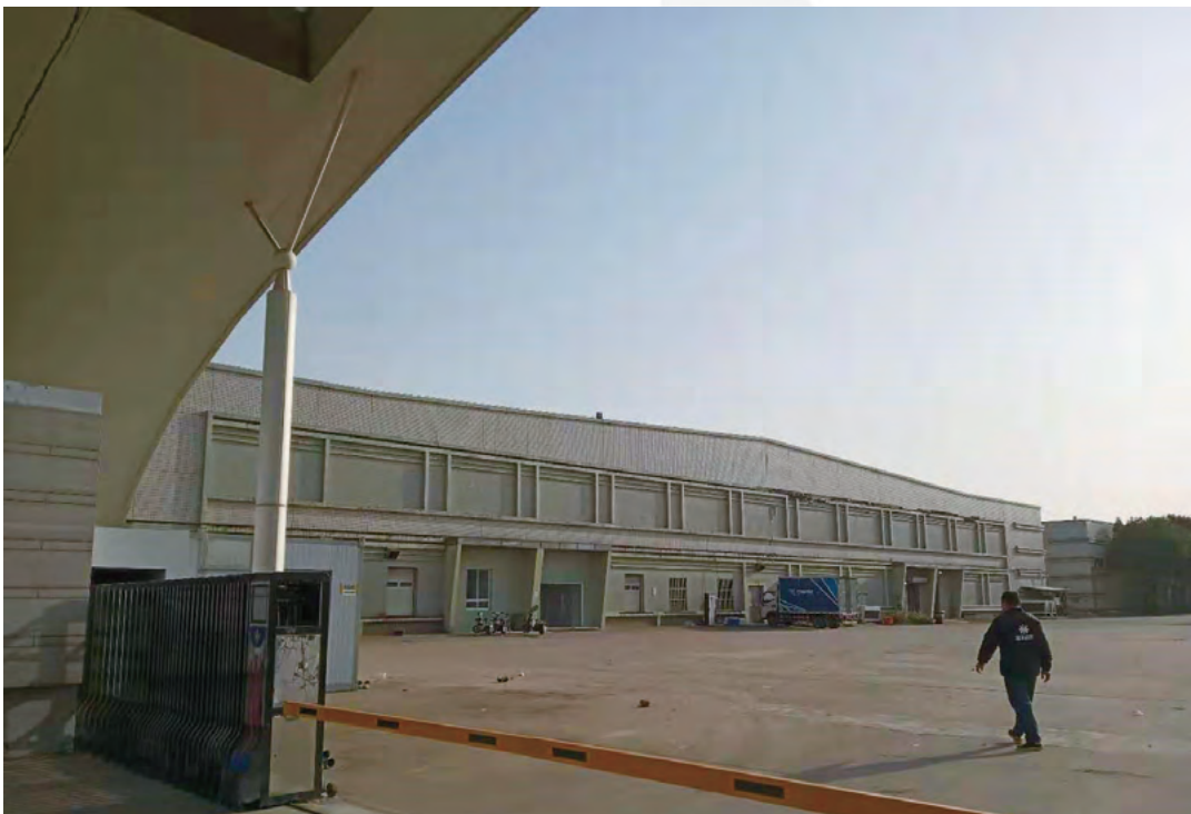
▲Wuxi Base in Wuxi National High-Tech Industrial Development Zone

As at 31 November 2018, the Group disposed its certain subsidiaries to an independent third party, which includes Weishuo Industrial (Shanghai) Company Limited ("Shanghai Weishuo") and its Fresh Express Logistics Warehouse located at Songjiang District, Shanghai ("Songjiang Base"). The Group transferred its cold-chain food storage and logistics business to Logistics Warehouse ("Wuxi Base") of Wuxi Sada Industrial Co., Ltd ("Wuxi Sada"), another subsidiary of the Group, after the Period. As Songjiang Base and Wuxi Base has been a primary cold-chain food storage warehouse of the Group in Year 2019 and cold-chain food business is relatively energy-consuming, which bears higher relevance to the environmental, social and governance matters, this report will focus on the disclosure of the policies and performance regarding to three environmental aspects and eight social aspects of Shanghai Weishuo and Wuxi Sada in Year 2019.