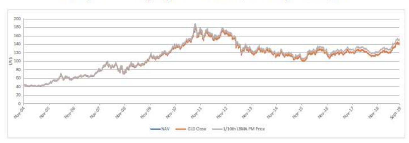
Share price & NAV v. gold price - November 18, 2004 to September 30, 2019

NYSE on 18 November 2004 to 30 September 2019, and is based on the previous gold pricing benchmark, the London PM Fix (as defined below), before it was replaced by the 3:00 p.m. London time LBMA Gold Price (the "LBMA Gold Price PM") on 20 March 2015. London Gold Market Fixing Limited had been publishing a fix during London trading hours, which provided reference gold prices for the day's trading (the "London Fix"). Market participants usually referred to either the morning (AM) or afternoon (PM) London Fix (the "London PM Fix") when looking for a basis for valuations.