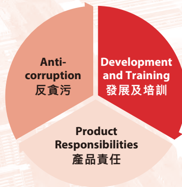
Figure 1 Importance assessment 圖1 重要性評估

The Group has commissioned independent third-party consultants to conduct management interviews to develop the Group's sustainability strategy and direction, and to identify environmental and social issues that are critical to the Group and its stakeholders. The Group selected the following three issues from 11 environmental and social aspects of the environmental, social and governance reporting guidelines as the focus of the report: