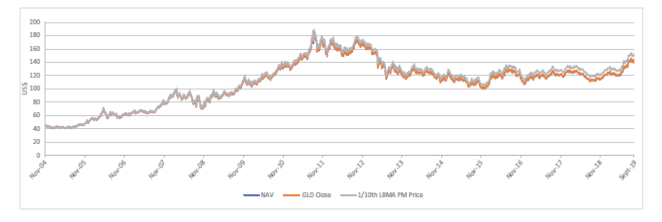
Share price & NAV v. gold price - November 18, 2004 to September 30, 2019

March 2015. London Gold Market Fixing Limited had been publishing a fix during London trading hours, which provided reference gold prices for the day's trading (the "London Fix"). Market participants usually referred to either the morning (AM) or afternoon (PM) London Fix (the "London PM Fix") when looking for a basis for valuations.