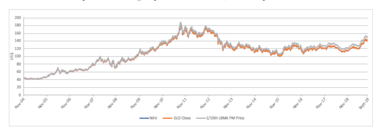
Share price & NAV v. gold price – November 18, 2004 to September 30, 2019

March 2015. London Gold Market Fixing Limited had been publishing a fix during London trading hours, which provided reference gold prices for the day's trading (the " London Fix "). Market participants usually referred to either the morning (AM) or afternoon (PM) London Fix (the " London PM Fix ") when looking for a basis for valuations.