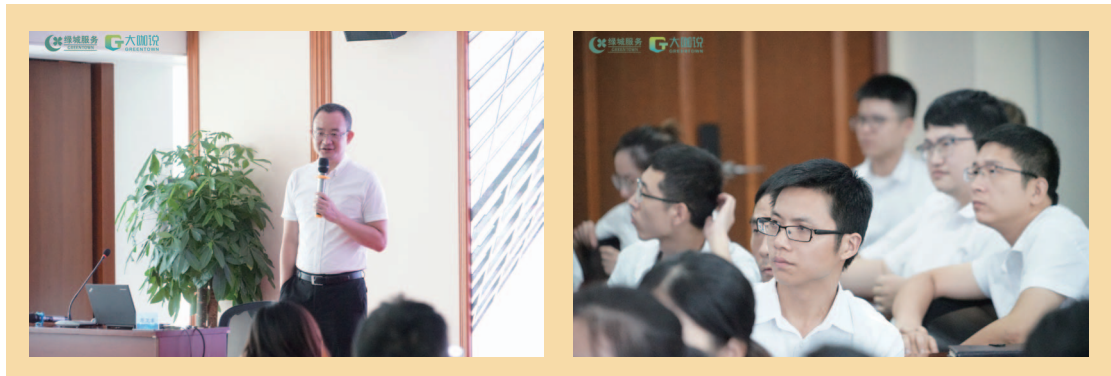
Figure 2 Staff activity day

The Group has strictly complied with relevant safety legislation and has not been prosecuted for breaching occupational safety-related legislation during the Reporting Period.