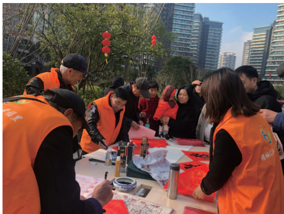
Figure 8 Activities in Happiness Land