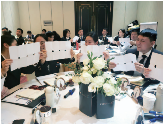
Figure 3 Staff training

In terms of external training, the "Business School Program" of Greentown Service Group is working with high-end business schools to further enhance the management vision and pattern of senior managers, enrich management knowledge and enhance leadership. At the same time, we will also arrange qualification training and related certification for staff to encourage them to move towards a more enriched career.