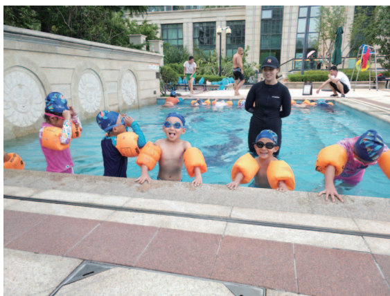
Figure 7 Dolphin Program

Greentown Service Group holds “Dolphin Program” during July to August each year to provide young owners at the age of 3 to 18 who are unable to swim with the free swimming training. Dolphin Program has been conducted for 10 years. In 2019, 16,864 young property owners participated in the training.