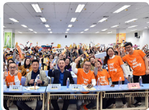
舉辦大學校園招聘會 Careers fair at a university campus