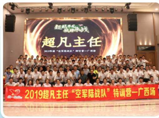
2019超凡主任「空軍陸戰隊」特訓營 2019 "Air and Land Forces (空軍陸戰隊)" Training camp for excellent senior officers