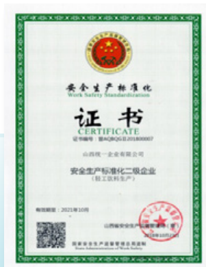
安全生產標準化認證證書 Certificate for Safety Production Standardization