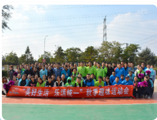
秋季趣味運動會 Autumn Fun Sports Day