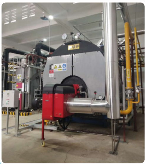
合肥統一鍋爐低氮改造 Modification of the boilers in Hefei President with low-nitrogen technology

Boilers of the Group's four factories in Zhengzhou, Jinan, Xinjiang and Hefei have been modified with low-nitrogen technology, amounting to a total investment of RMB7.3 million. The emission of nitrogen oxide decreased by 6.0 tonnes in 2019 with such modified boilers.