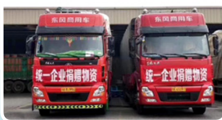
成都統一四川宜賓抗震救災 Disaster relief activity of Chengdu President for the earthquake in Yibin, Sichuan

In 2019, the Group devoted approximately RMB601,000 and 1,875 hours for social and public welfare activities and natural disaster donations, primarily through blood donation, charity sale, book donation, send-off students for high school examination, elderly visit and care for sanitation workers. At the same time, we actively responded to the government's call for "Love the Nature, Happy Tree-planting" and provided prompt support in times of natural disasters. For the earthquake in Yibin, Sichuan and the flooding in Jiangxi, we immediately organised disaster relief activities to offer as much assistance as we could by donating necessary supplies to the disaster-stricken areas.