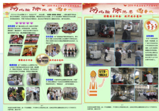
EHS月刊 EHS monthly newsletter