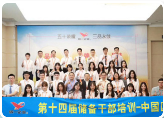
管培生項目培訓 Training for management trainees

In accordance with the Group's "Operational Standards on Training Management of Uni-President China Investment" and based on job nature, the Group offered specialized training of different types and levels to newly recruits, junior supervisors, key personnel and management trainees, so as to enhance their business skills and management level in areas of corporate culture, safety education, professional skills, general skills and leadership, such as the "Air and Land Forces" training camp for excellent senior officers and the "New Media Class" training for new media personnel. In 2019, the Group held 410 sessions of online and offline trainings in total, and staff members spent an average of approximately 17.5 hours on the trainings (2018: 15.5 hours).