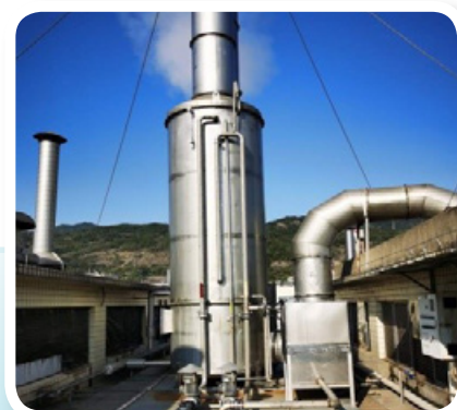
福州統一油煙淨化系統餘熱回收 Heat recovery from the oil fume purification system in Fuzhou President