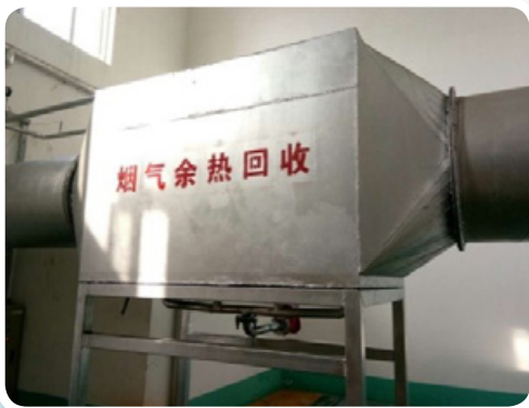
北京統一鍋爐煙氣餘熱回收 Boiler flue gas heat recovery in Beijing President

Through application of boiler flue gas heat recovery as well as heat recovery from the oil fume purification system and steam box energy saving system, the Group reduced its steam consumption by 1,579 tonnes in 2019.