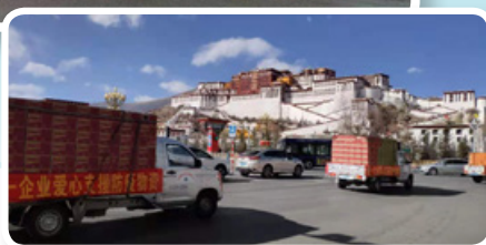
2020眾志成城共克時艱 統一企業物資愛心捐贈 第一時間出發

To tide over the difficulties with united efforts, Uni-President immediately donated supplies in 2020