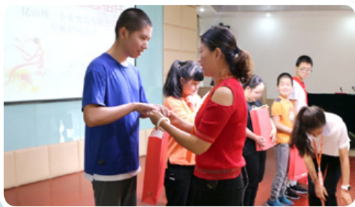
昆山統一「愛心學校」公益活動 The “Caring School (愛心學校)” public welfare activity in Kunshan President

Apart from satisfying consumers’ diverse needs for food, based on the principle of “giving back to the community”, the Group has continuously dedicated money and time to public welfare activities as its contributions back to the community. The Group constantly formulated and improved regulatory documents on public welfare activities such as the “Procedures of Donation for Natural Disasters” and “Code for Group Activities under the Name of the Company” to evolve with times. It encourages the public to be “optimistic, ambitious and nature-loving” by organising and participating in a wide range of public welfare activities including charitable, cultural and sports education, and environmental protection activities. Through participation in various social and public welfare activities, the Group’s philosophy of “Life matters most, Healthy life, Caring for the environment” is thoroughly reflected, showcasing its commitment to corporate social responsibility.