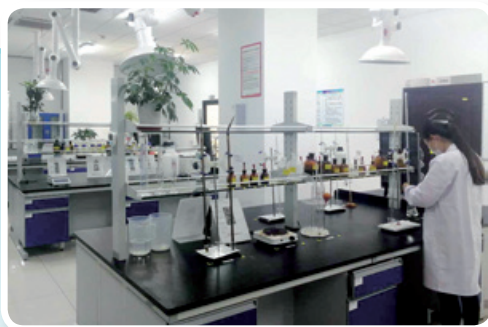
上海統一企業飲料食品 有限公司理化試驗室 The physics and chemistry laboratory at Uni-President Enterprises (Shanghai) Drink & Food Co., Ltd.

The advertisement and promotion projects for the Group’s brands and products have been conducted in strict accordance with relevant laws and regulations such as the “Advertisement Law of the People’s Republic of China” and there was no violation against the advertisement laws in 2019.