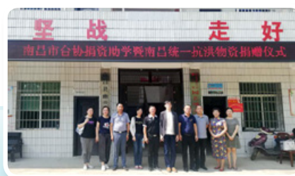
南昌統一抗洪救災愛心捐贈 Flood relief donation by Nanchang President

2020年伊始，全國各地發生「新型冠狀病毒感染的肺炎疫情」以來，全國各級政府、企業、社會團體以及個人紛紛以不同方式積極支援抗擊病毒阻擊戰的第一線，在全國範圍內形成了萬眾一心、眾志成城的火熱行動與氛圍。截至2020年3月4日，本集團已累計捐贈了價值超過人民幣21百萬元物資及善款，充分體現了企業的社會責任和積極姿態。