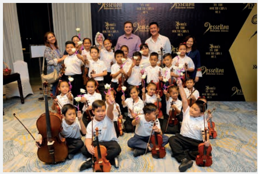
SK Bantanyan students celebrate together after their soirée debut

$139,882 Total value of community investment