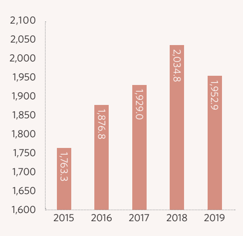
Total Scope 1&2 Carbon Emissions (ktCO<sub>2</sub>e)