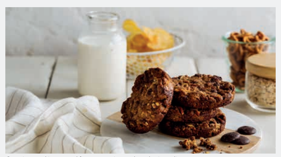
Conscious cookies created from extra trims and surplus ingredients

42,000 + Meals donated during Ramadan for children-in-need