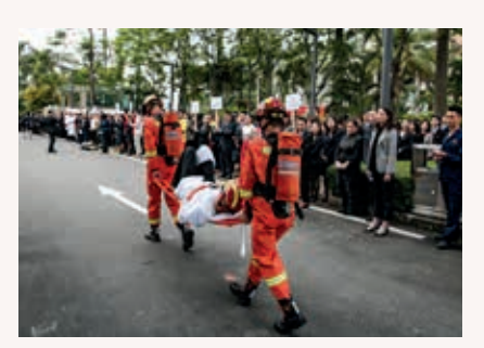
Colleagues in Guangzhou participate in a fire drill and evacuation exercise in collaboration with the local Police & Fire Department

In April 2019, we hosted a group-wide fire drill and evacuation exercise to strengthen our safety culture and prepare our colleagues to handle any emergency situation. Many of our hotels conducted fire drills and safety training activities in collaboration with local fire departments and civil defence forces.