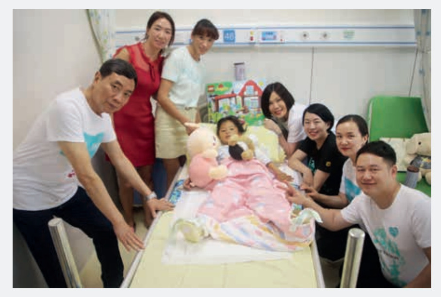
Our colleagues in Nanjing visit a beneficiary of the Ride for Hope programme as she recovers in hospital after receiving life-changing-surgeries

In 2018, our colleagues in China raised RMB5.7 million through our CSR initiative called Ride for Hope 3 to help children with hip disabilities and heart diseases in collaboration with the Ai You Foundation's Morning Star Project. With the support of funds raised through this community outreach project, in 2019, 240 orphaned and financially disadvantaged children received life-changing surgeries.