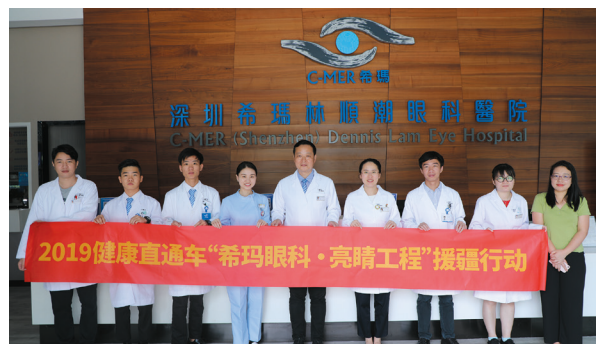
「援疆情·光明行」啟動 Free eye check-up and cataract surgery in Xinjian

We are looking for more opportunities in contributing to the community, and we are going to participate more in community investment in the near future.