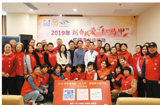
關愛紅馬甲眼健康活動 Free eye check-up in Shenzhen

We are looking for more opportunities in contributing to the community, and we are going to participate more in community investment in the near future.