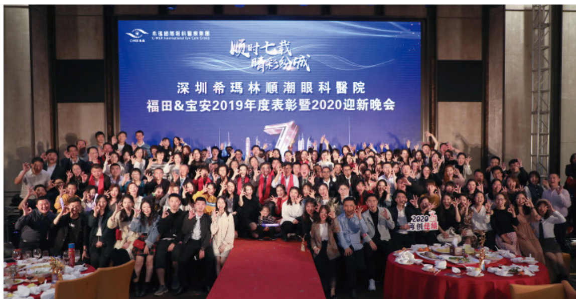
2019年周年晚宴年度晚會 Annual Dinner 2019

本集團安排各種內部員工活動以作鬆弛及建立團隊精神，並答謝僱員辛勤工作及加強跨部門團隊合作。活動包括年度晚宴及各種團建活動。透過該等活動，不同部門的僱員有所互動，營造士氣高昂的工作氣氛，有利工作生活平衡及提升生產力。