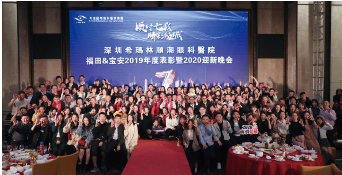
2019年周年晚宴年度晚會 Annual Dinner 2019

本集團安排各種內部員工活動以作鬆弛及建立團隊精神，並答謝僱員辛勤工作及加強跨部門團隊合作。活動包括年度晚宴及各種團建活動。透過該等活動，不同部門的僱員有所互動，營造士氣高昂的工作氣氛，有利工作生活平衡及提升生產力。