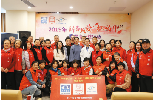
關愛紅馬甲眼健康活動 Free eye check-up in Shenzhen

We are looking for more opportunities in contributing to the community, and we are going to participate more in community investment in the near future.