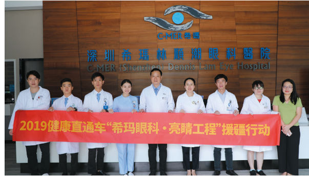
「援疆情·光明行」啟動 Free eye check-up and cataract surgery in Xinjian

We are looking for more opportunities in contributing to the community, and we are going to participate more in community investment in the near future.