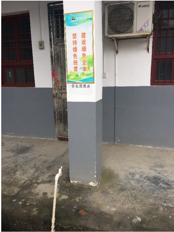
▲ Put green slogans in the factory to build green enterprises