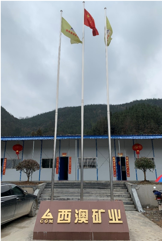
▲ Guanzhuang Gold Mine located in Guanzhuang Town, Yuanling County, Huaihua City, Hunan Province, China

The Report is prepared in accordance with the Environmental, Social and Governance Reporting Guide as set out in Appendix 27 of the Rules Governing the Listing of Securities on The Stock Exchange of Hong Kong Limited. The Report primarily highlights the Group’s major initiatives and activities implemented from 1 January 2019 to 31 December 2019 (“ Year 2019 ”). For information regarding the corporate governance of the Group, please refer to the Company’s 2019 annual report.