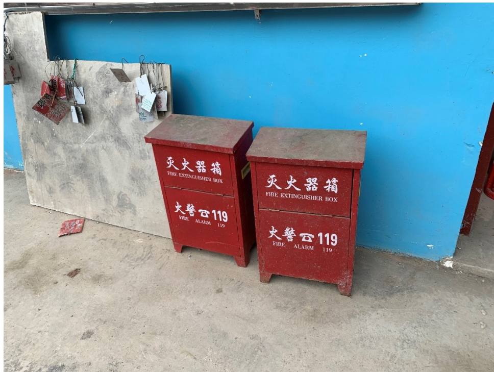
▲ Fire equipment in the mine area

Poisoning and Suffocation Hazards: Poisoning and suffocation hazards are caused by the airborne dust and soot from explosion and other airborne contaminants at the mine, which include: the mixture of sulfide and air formed by the oxidation of the ore body, and air contaminants in the cave, the goaf and the tunnel. The mine is divided into separate mining zones with separate ventilation system in each zone, and use the central exhaust ventilation system to vent the air out of the mine. Hunan Westralian has formulated a “Ventilation and Dust Management System”, which requires the production technology department, environmental safety department, and the mechanical and electrical management unit of the mine area to strictly abide by it.