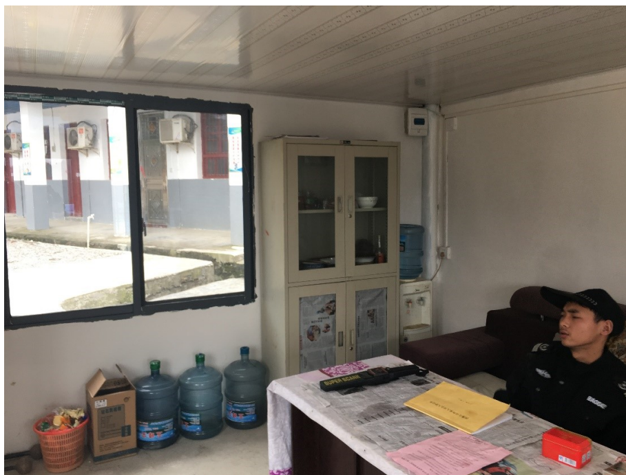
▲ A security duty room is set up in the mine area and is guarded by security guards 24 hours a day.

In order to put our guiding principles of "placing safety first, preventing injuries as core, and managing comprehensively" ("安全第一，預防為主，綜合治理") into practice, and to strengthen the managements of safety training, Hunan Westralian has set out guidelines in accordance to Safe Production Law of the People's Republic of China, Safety Training Management Measures (Safety Supervision Bureau Decree No. 44) and the relevant laws and administrative regulations, to ensure the quality of our job safety training and further its development. Furthermore, the Company provided a variety of well-planned and specialized safety trainings which are tailored to the realistic working conditions, in order to promote a higher level of safety awareness for all.