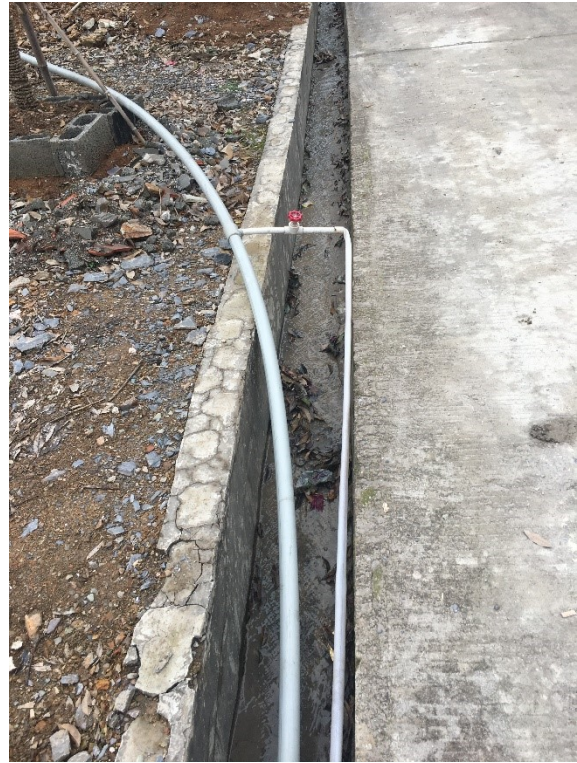
▲ Water pipe is used as water flow for treatment

Hunan Westralian adheres to green operation and is committed to building green enterprises. During Year 2019, Hunan Westralian deliberately planted about 430 trees to beautify the living area of the plant. This action can reduce greenhouse gases. In addition, in order to effectively reduce the water consumption, the industrial water used in ore processing in the mining area is taken from groundwater, and the wastewater generated is recycled and reused in the ore processing plant.