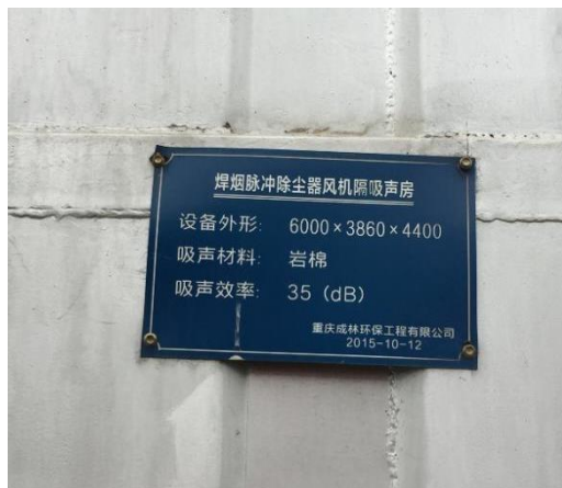
Figure 2 Physical Sound Insulation Measure—Noise Absorption Room

During the Reporting Period, the Group received no complaints on noise pollution.