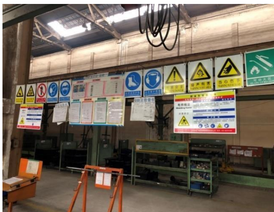
Figure 3 Items on Occupational Safety-Warning Signs