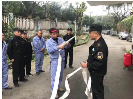
Figure 6 Fire Hose Laying Training