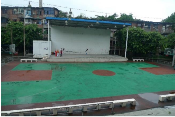
Figure 9 Provision of cultural venues

The Group has formulated the Measures for Management of Charity and Public Benefit Campaigns which sets out detailed provisions on the capital source, capital management, types of main events, summary and propaganda, and assessment of charity and public benefit campaigns. During the Reporting Period, the Group provided cultural venues for the community allowing the people in the community to use facilities.