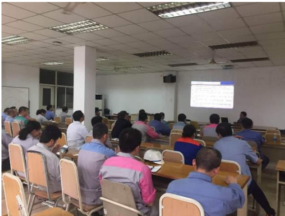
Figure 5 Fire Safety Knowledge Training