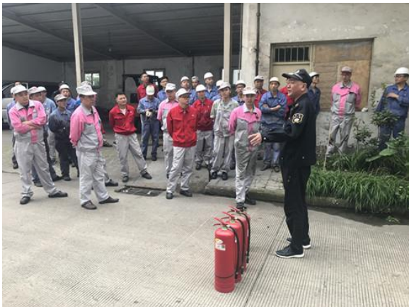
Figure 7 Learning How to Use Fire Extinguishers and Points to Note