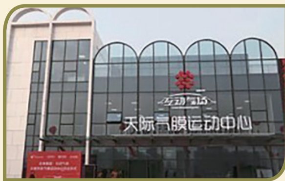
Photo of Tianji Air Dome Sports Centre Stadium 天際氣膜運動中心場館圖

在霧霾嚴重的北方，氣膜場館配備的新風過濾系統將外界空氣經過多層過濾後送入場館，將霧霾隔絕在外，保證場館內空氣質量。相比傳統的體育建築場館，氣膜場館憑借其特有的建築材料和場館構造，可實現節約50%能源。同時，氣膜場館建築週期短、建築成本低、使用年限長，被評為目前全球技術領先的體育設施。