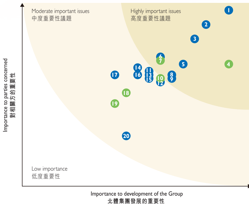
ESG issues importance analysis matrix diagram of the Group 北體集團ESG議題重要性分析矩陣圖