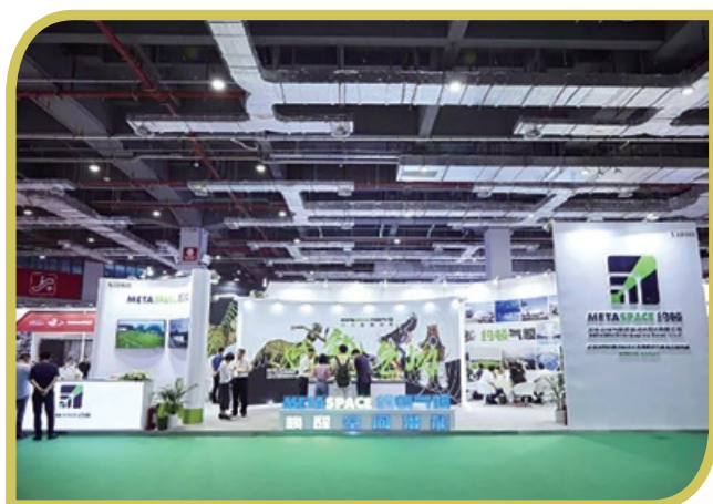
MetaSpace exhibited new products at Sports Expo 約頓氣膜產品亮相中國國際體育用品博覽會

During the China International Sporting Goods Expo 2019 (the "Sports Expo"), MetaSpace Air Dome has the theme of "Creating value with depth, fitting the future with technology". Through product upgrading, MetaSpace Air Dome shapes a new company image and constantly explores the advantages of air dome products. It is aiming to reawaken the potential of the space with deep customized design, and contribute more efficient and environmentally-friendly sports space to Chinese sports.