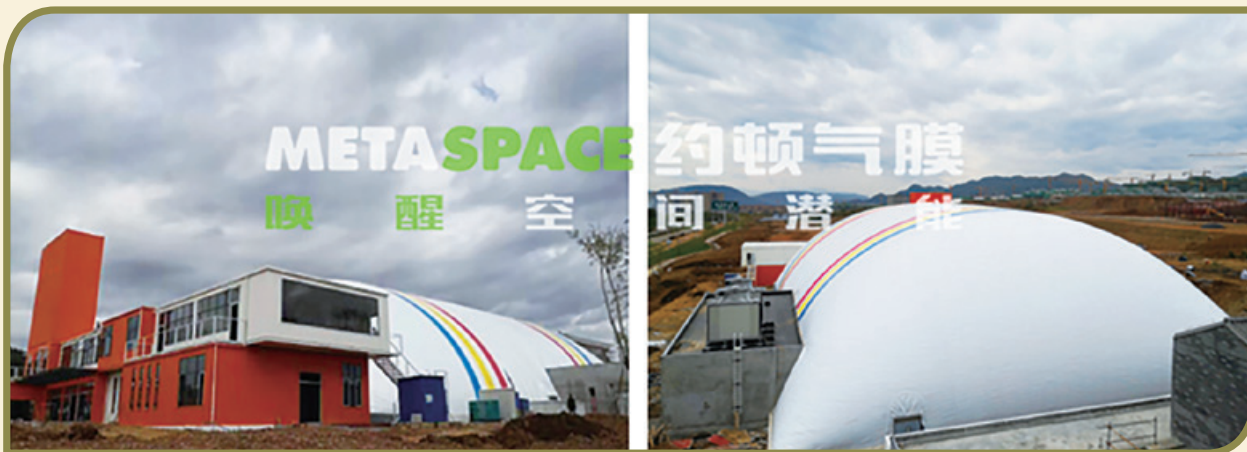
MetaSpace air dome 約頓氣膜產品

2019年，在“3億人上冰雪”這一國家戰略的號召下，國內冰雪運動發展迅速，約頓氣膜針對氣膜產品在冰雪領域的應用開展了一系列的研究。在氣膜冰雪館的保溫隔熱，館內通風循環，風口及風道設計等細分技術領域進行了研發創新，研發出約頓高效節能氣膜冰雪館，具有空間利用率高、保溫效果好、運營成本低、維護方便快捷等諸多特點，得到了廣大客戶的認可。