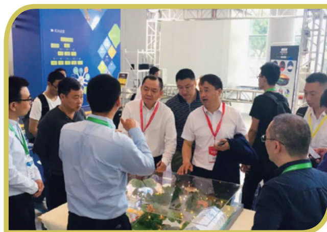
MetaSpace All-weather Air Dome displayed in the 76th China Educational Equipment Exhibition 約頓氣膜全天候健康運動館參加76屆中國教育裝備展示會