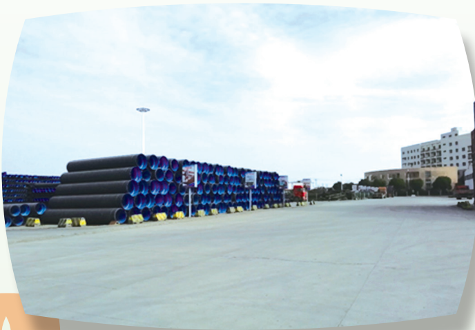
Reinforcement of stockyards at Jiaying International Feeder Port 強化位於嘉興國際內河碼頭的港區堆場

在報告期間，沒有發生有關環境的法律及法規且可能對集團產生重大影響的重大不合規事項。