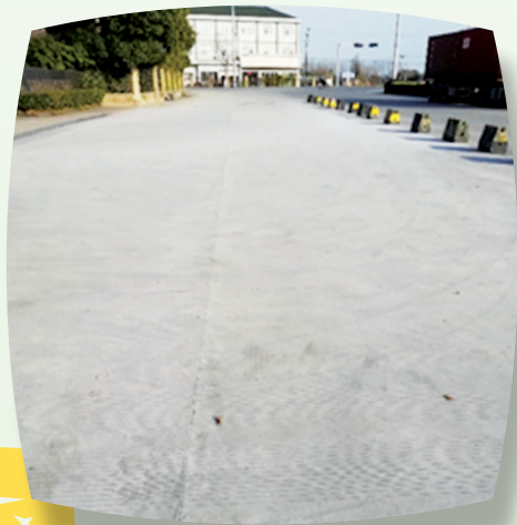
Regular cleaning and maintenance of paved access roads at Jiaying International Feeder Port 定期清潔和維護位於嘉興國際內河碼頭的的道路