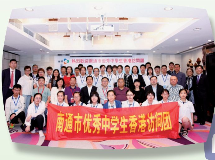
Organized in July 2019 and sponsored by PYY: Nantong Outstanding Secondary School Students — Hong Kong Visit 於2019年7月舉辦及由保華贊助： 南通市優秀中學生香港訪問團

在報告期間，保華連同保華建業，捐贈了100萬港元給「希望之友教育基金」，以支持香港和內地的教育發展。而我們在上海的全資子公司亦向湖北省的慈善機構捐贈了共人民幣20萬元，以支援當地醫院在2020年初2019新型冠狀病毒疫情大流行期間的抗疫工作。連續十二年，我們獲得了香港社會服務聯會頒發的「商界展關懷」的稱號，以表彰我們的企業公民責任和我們對社區關愛的持續努力。我們內地的經營單位也同樣開展當地的各項活動來履行我們回報社會的承諾並加強與周邊社區的聯繫。例如，於2020年第一季度2019新型冠狀病毒疫情爆發期間，我們的民生石油為了維持武漢當地交通的基本需求而提供有限度的液化石油氣／壓縮天然氣加氣服務。