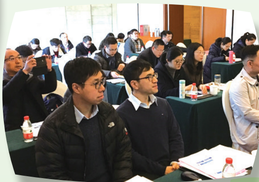
Financial training workshop organized by PYI's Hangzhou training centre 由保華的杭州培訓中心組織的財務培訓工作坊