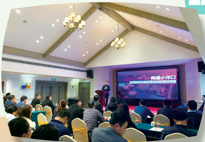
Training organized at Xiao Yangkou 於小洋口進行的工作培訓

有關提供予董事及高級管理人員之培訓以及若干培訓項目(其為我們的風險管理及內部監控系統的一部份)之進一步討論，可參閱保華2020年報第58及59頁。