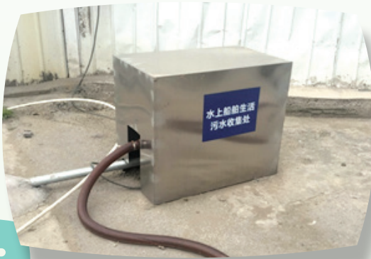
Cargo ship sewage reception facility at Jiaxing International Feeder Port 位於嘉興國際內河碼頭的貨船污水接收裝置

除生活污水外，我們經營港口及物流的業務亦產生工業污水(如清洗堆場及機械的廢水)。我們已設立沉澱池和油水分離系統等污水處理設施，污水經處理後會循環再使用或合法地排放。我們旗下的嘉興內河國際碼頭已於港區設立污水接收裝置，以方便船舶於停泊期間，將船舶生活污水接駁至市政的污水管網進行排放。