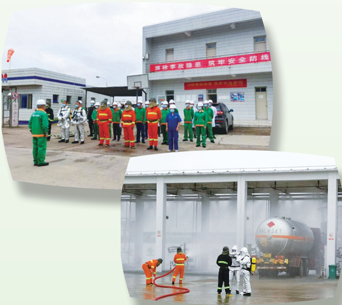
Fire drill at LPG storage tank farm of Minsheng Gas 位於民生石油的的液化石油氣儲庫基地進行的防火演練