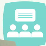
Financial training workshop organized by PYI's Hangzhou training centre 由保華的杭州培訓中心組織的財務培訓工作坊