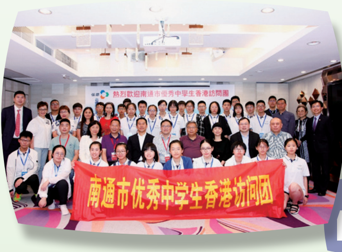
Organized in July 2019 and sponsored by PVI: Nantong Outstanding Secondary School Students — Hong Kong Visit 於2019年7月舉辦及由保華贊助： 南通市優秀中學生香港訪問團

在報告期間，保華連同保華建業，捐贈了100萬港元給「希望之友教育基金」，以支持香港和內地的教育發展。而我們在上海的全資子公司亦向湖北省的慈善機構捐贈了共人民幣20萬元，以支援當地醫院在2020年初2019新型冠狀病毒疫情大流行期間的抗疫工作。連續十二年，我們獲得了香港社會服務聯會頒發的「商界展關懷」的稱號，以表彰我們的企業公民責任和我們對社區關愛的持續努力。我們內地的經營單位也同樣開展當地的各項活動來履行我們回報社會的承諾並加強與周邊社區的聯繫。例如，於2020年第一季度2019新型冠狀病毒疫情爆發期間，我們的民生石油為了維持武漢當地交通的基本需求而提供有限度的液化石油氣／壓縮天然氣加氣服務。